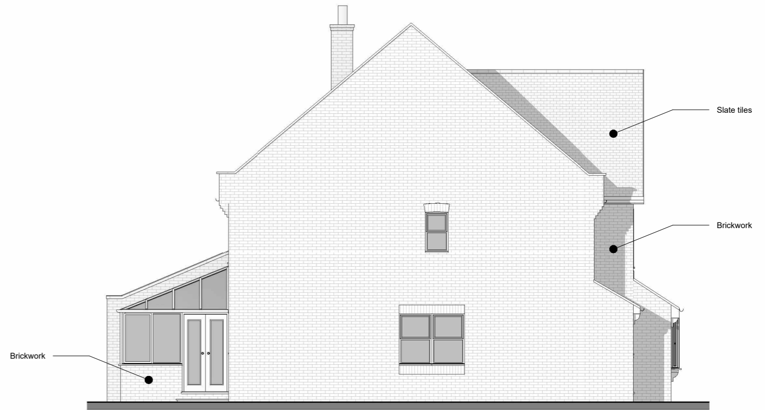
Side 1 Elevation