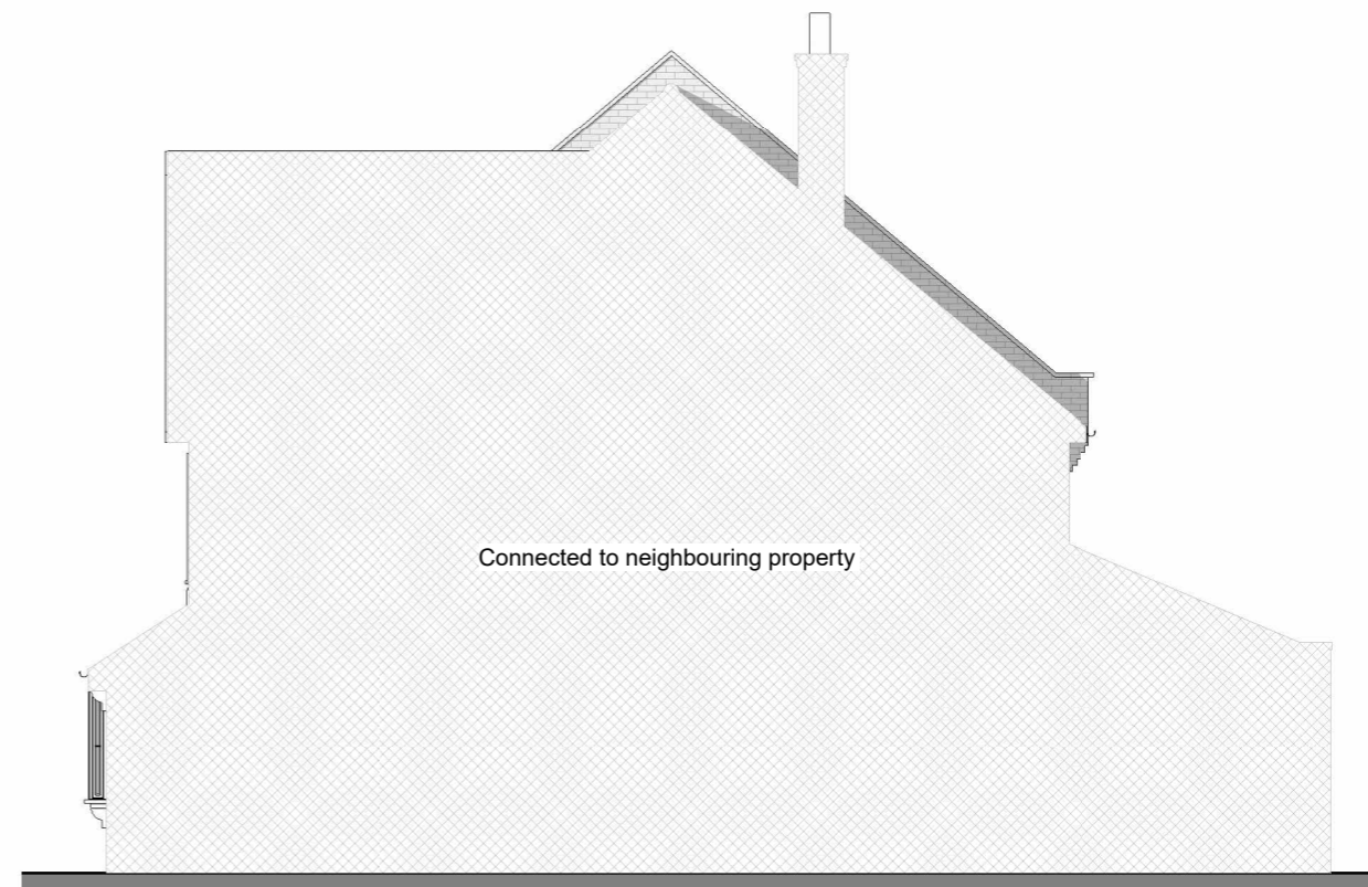
Side 2 Elevation