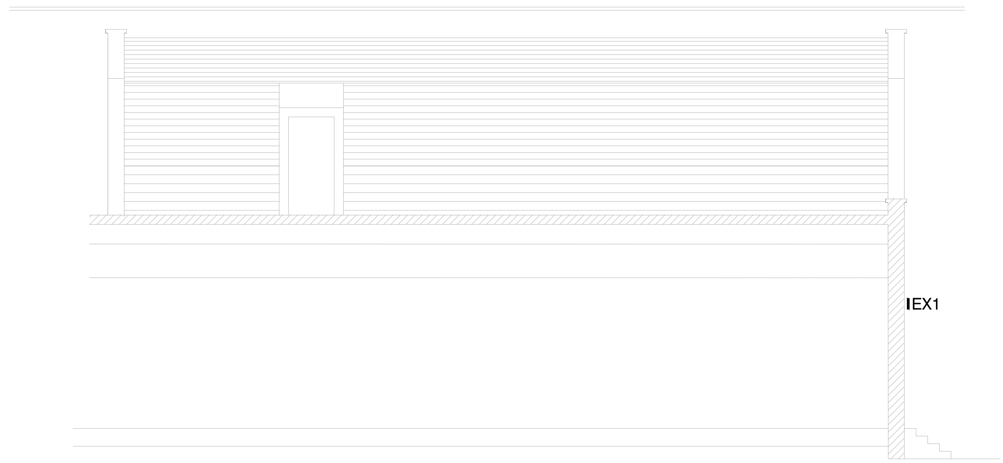
Proposed Elevation B