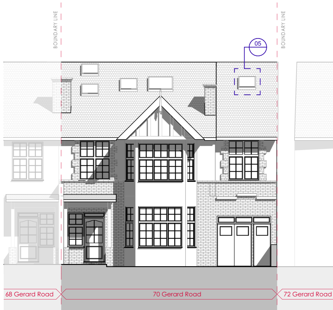
1:100 Proposed Front Elevation

The survey information shown on this drawing is based on a measured survey prepared by a third party. aThink Architects accept no responsibility for the accuracy or completeness of the survey.