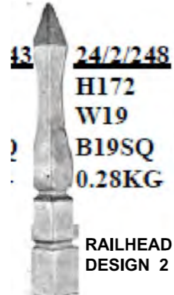
RAILHEAD DESIGN 2

GATE RAILHEAD DESIGNS TO MATCH NEW RAILINGS ADJACENT - SEE ALSO DWG DC/01B FOR FULL DETAILS