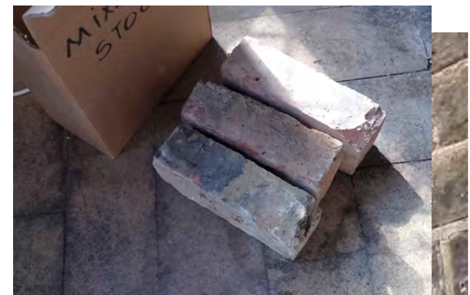
RAILHEAD DESIGN 1

440 x 440mm NEW BRICK PIER IN NEW OR RECLAIMED MULTI-STOCK BRICK FLEMISH BOND WITH LIME MORTAR AND POINTING TO MATCH DOUGHTY COTTAGE SEE ALSO DWG DC/07