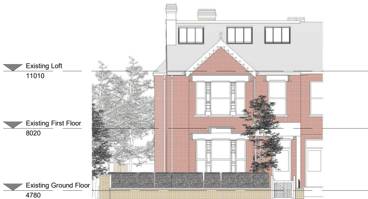
2 Proposed Front Elevation (South East)