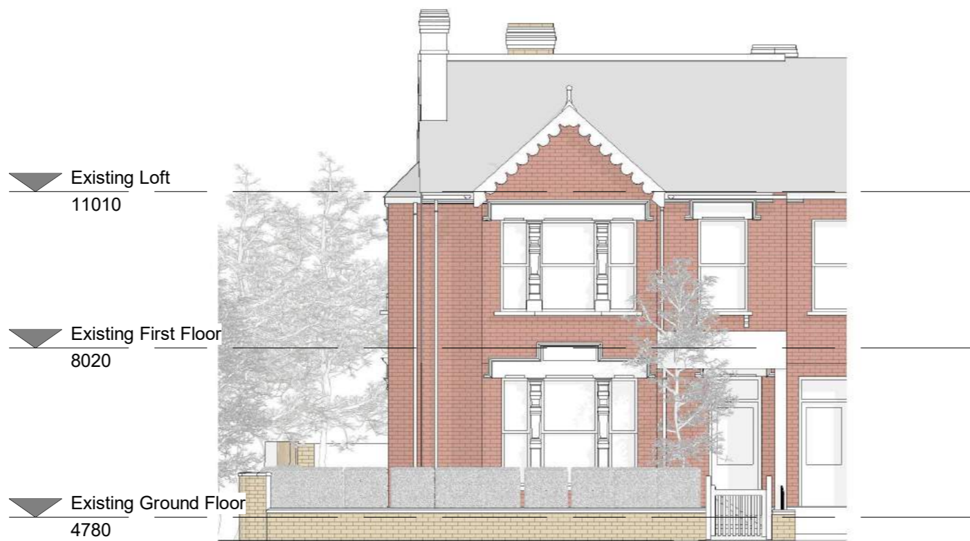
1 Front Elevation (South East)