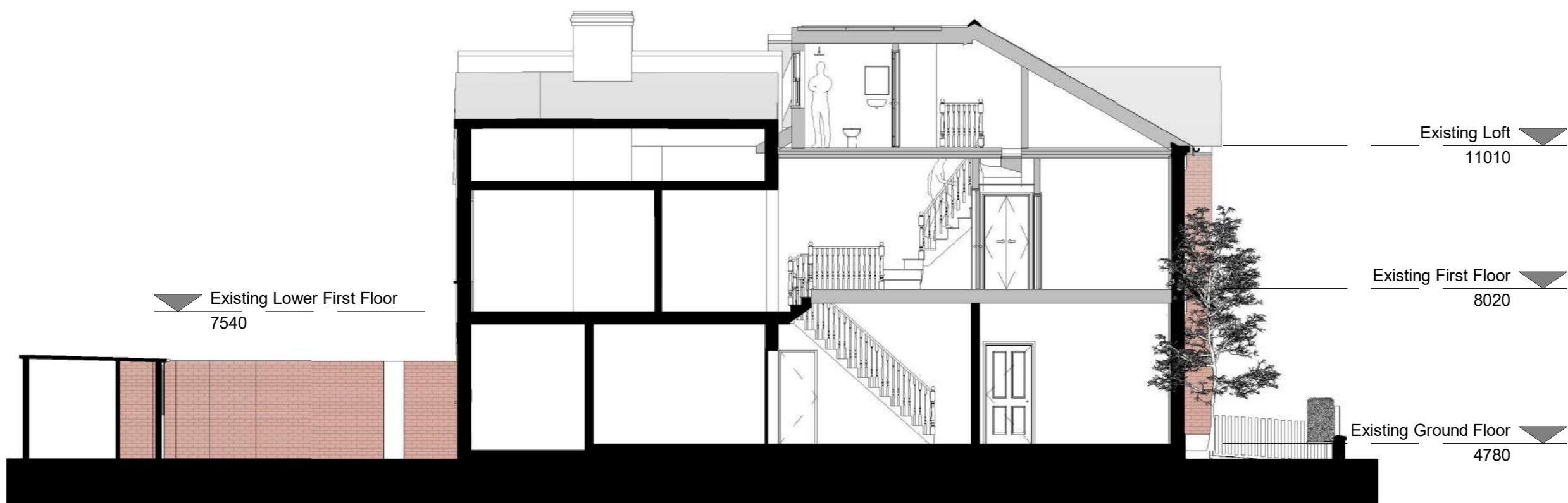
② Proposed Section A-A 1 : 100