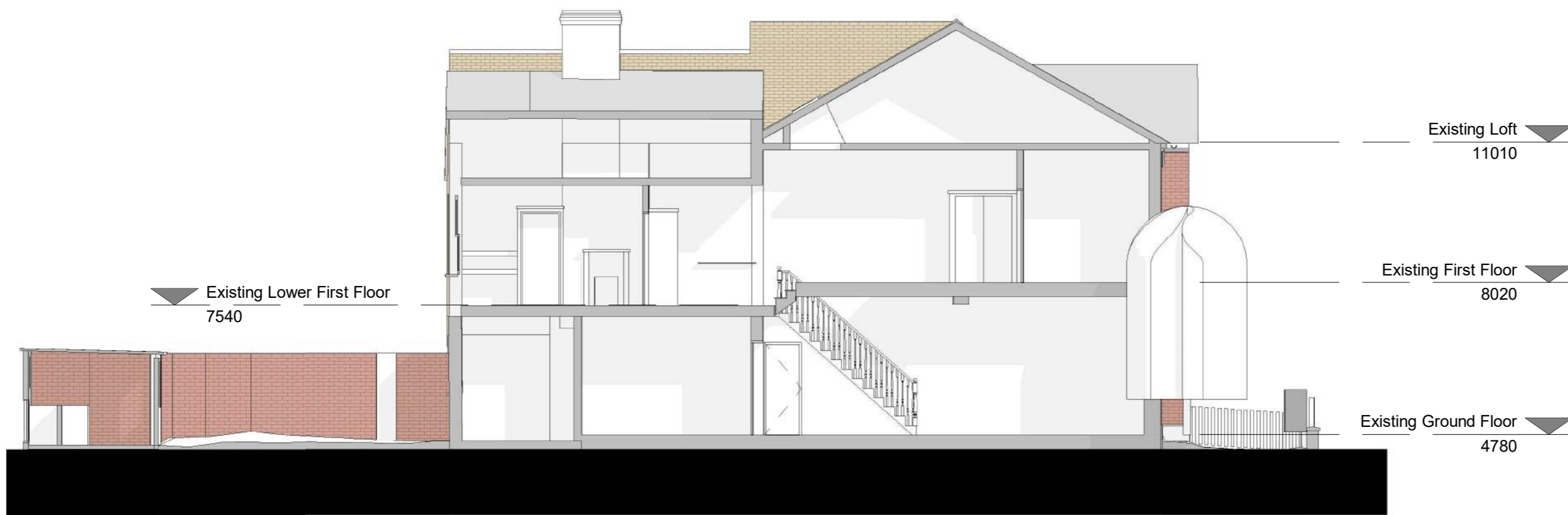
① Existing Section A-A 1 : 100