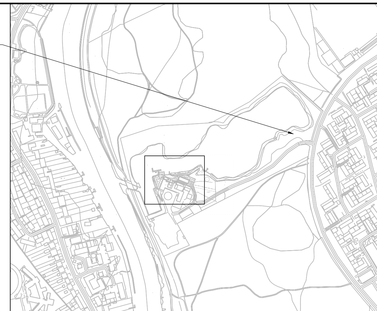
LAYOUT PLAN SCALE 1:5000