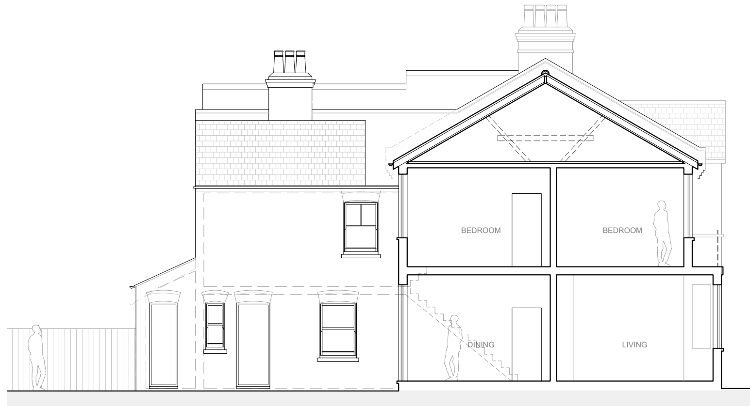
SECTION A-A (EXISTING)