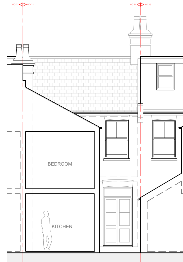
SECTION B-B (EXISTING)

NOTE: Do not scale (apart from when issued for Planning Application purposes). Figured dimensions only to be taken from this drawing. Dimensions are shown in millimeters unless noted otherwise. Check dimensions on site and report discrepancies to the Architect or Contract Administrator. Not to be used for Construction purposes unless stated. This drawing is protected by copyright and may not be reproduced without the Architect's written permission. The design is site specific and may not be reproduced on any other site without the Architect's written permission. All areas have been measured from current drawings. They may vary because of (eg) survey, design development, construction tolerances, statutory requirements or re-definition of the areas to be measured. This drawing is to be read in conjunction with all relevant details and other consultants information for the project