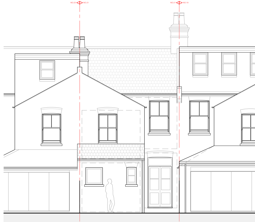
REAR ELEVATION - WEST (EXISTING)

0 1 2 3 4 5 Metres 0 2 4 6 8 10 12 14 Feet