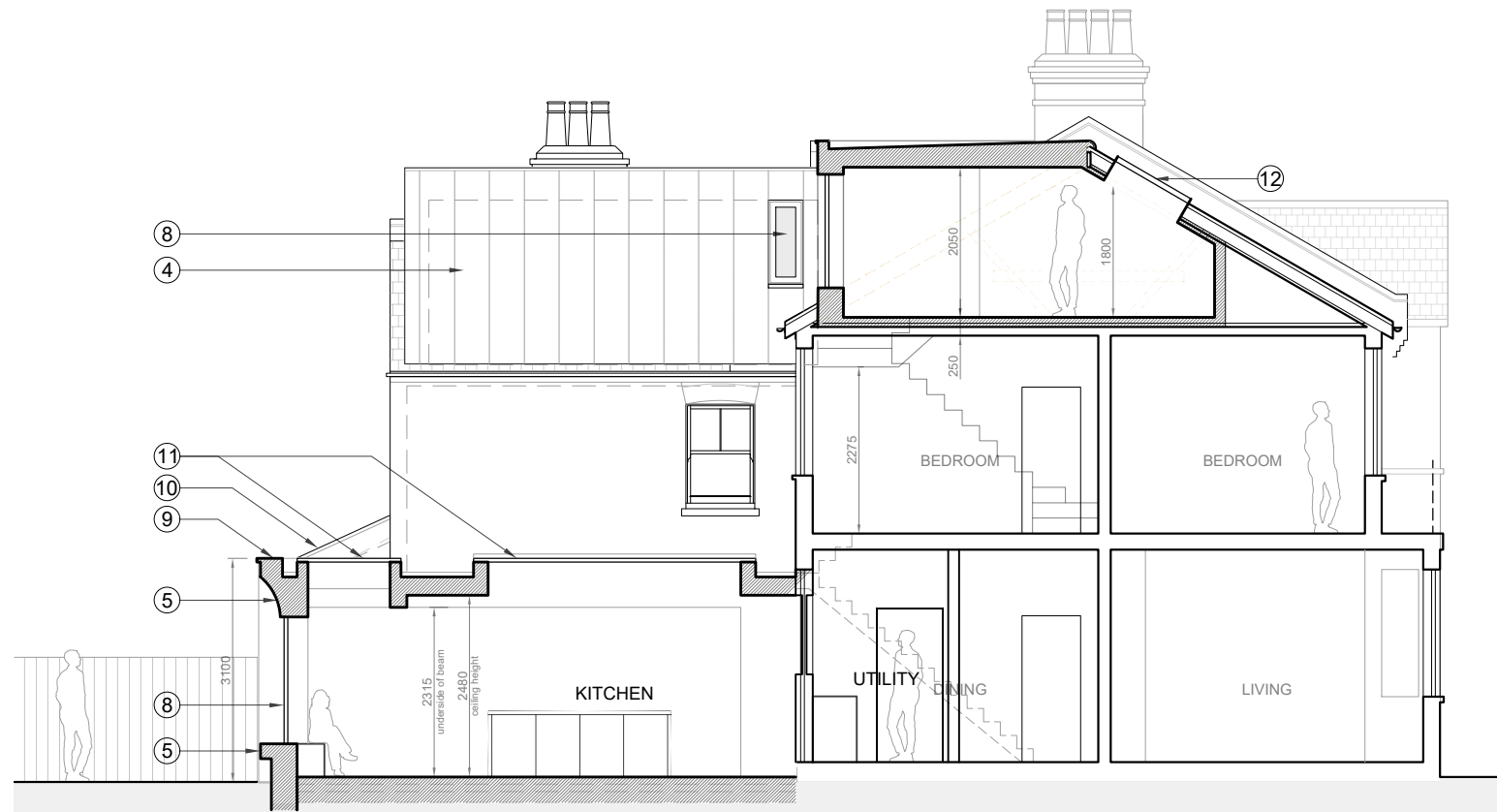
SECTION A-A (PROPOSED)