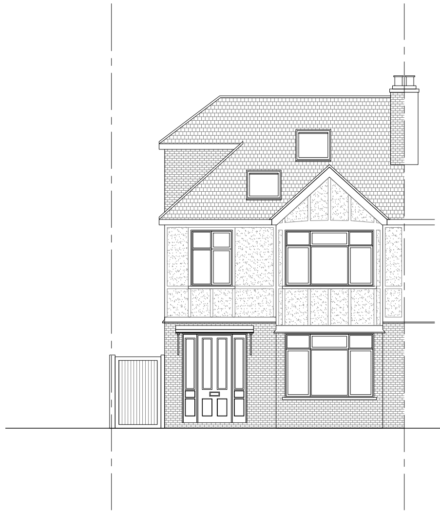
01 Existing Front Elevation