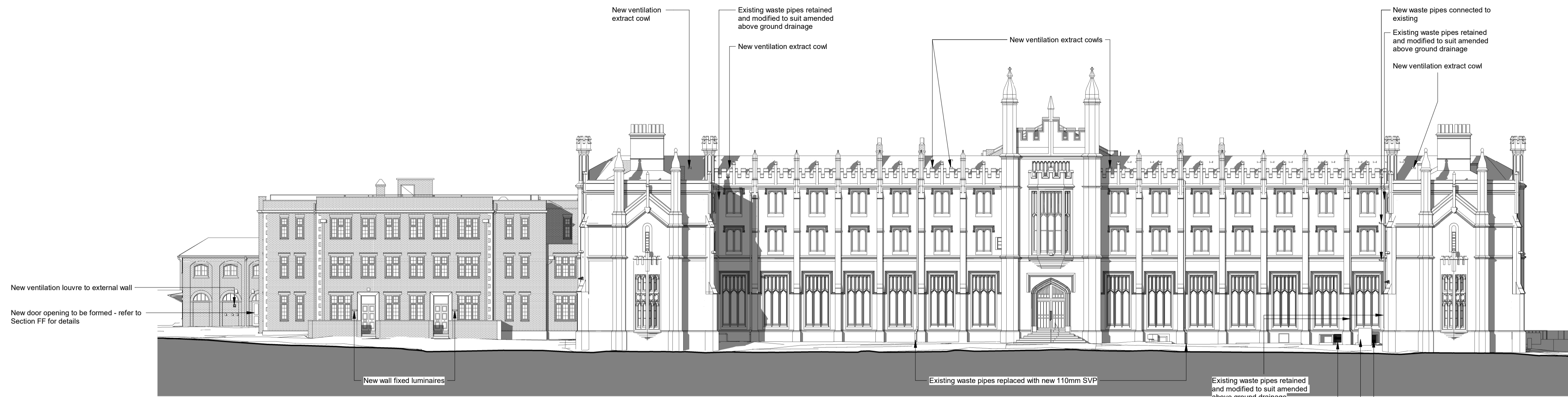
1 Main Building North East Elevation - Proposed 1:200