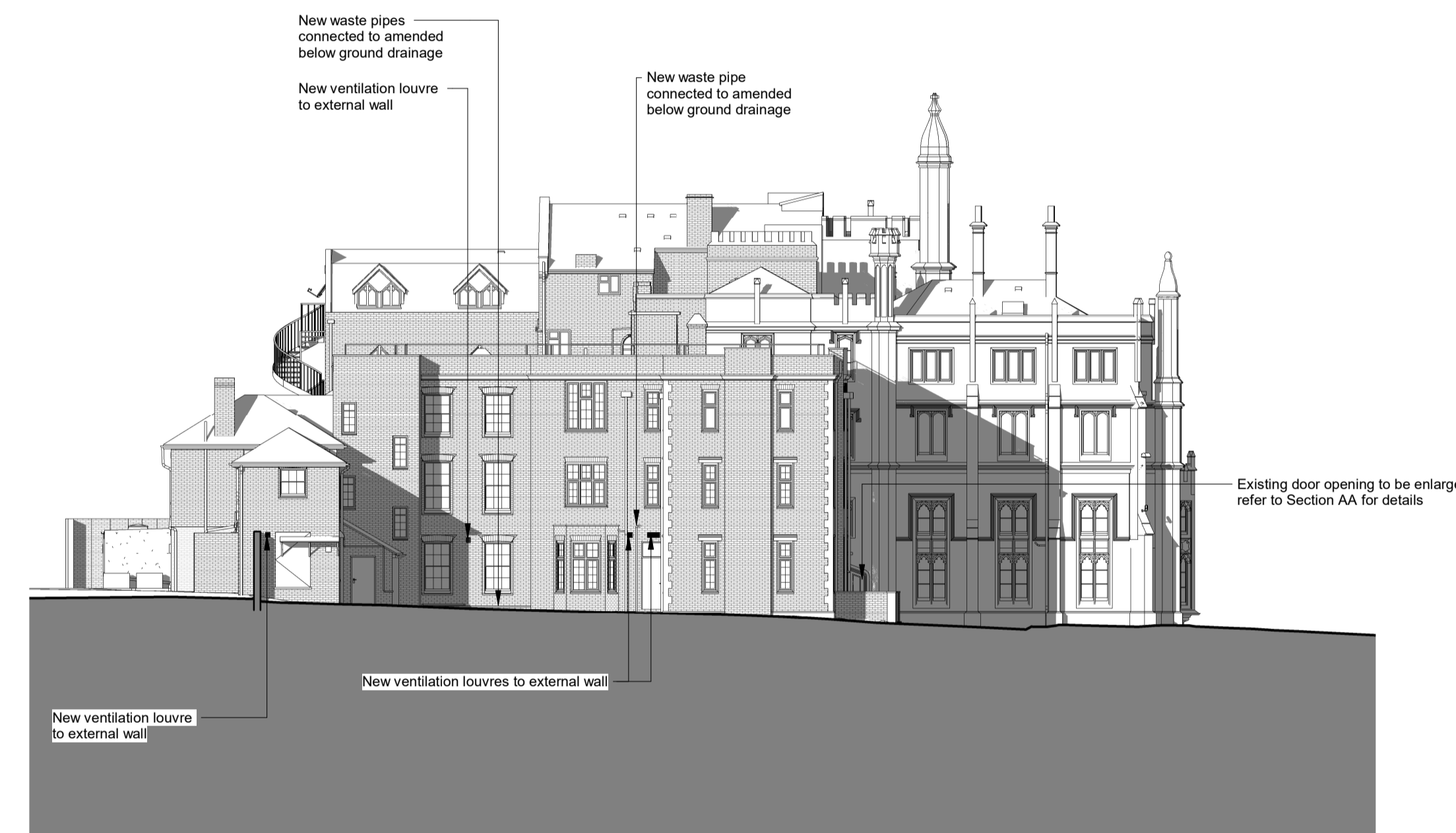
3 Main Building South East Elevation - Proposed 1:200