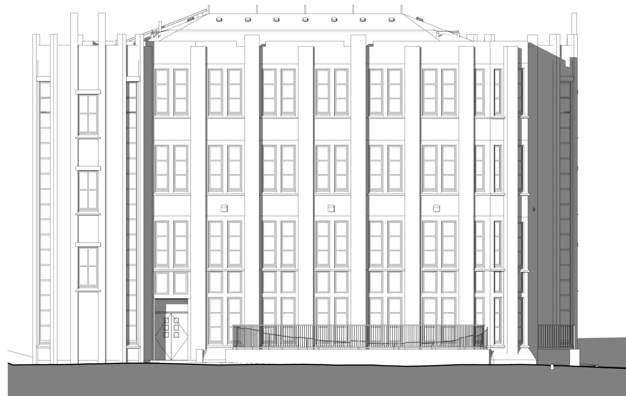
3 South Elevation - Existing 1: 100