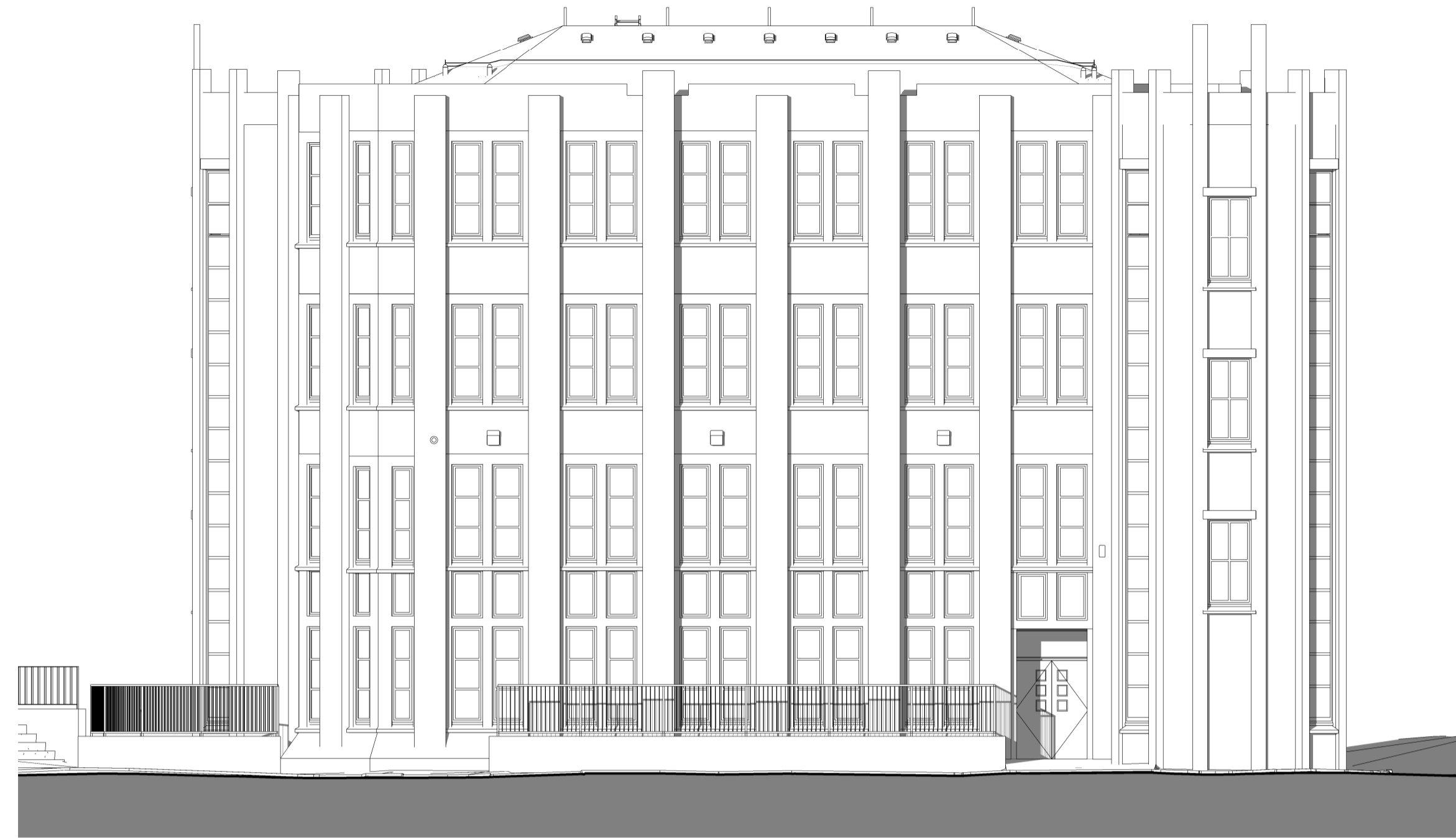
2 East Elevation - Existing 1: 100