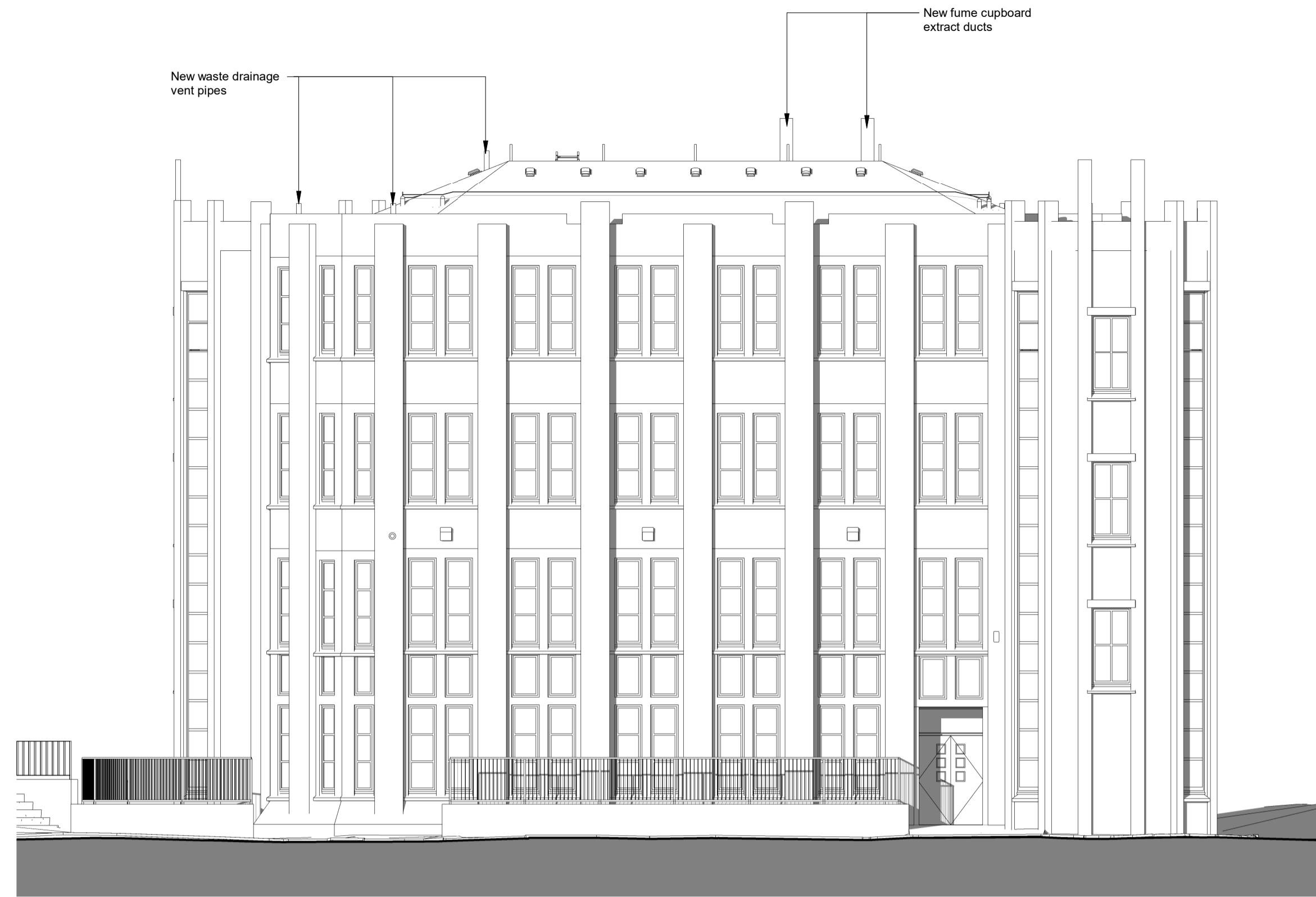
2 East Elevation - Proposed 1:100

2nr existing external condensers to be removed New external doors and ramped access with retaining walls and balustrading New wall fixed luminaires