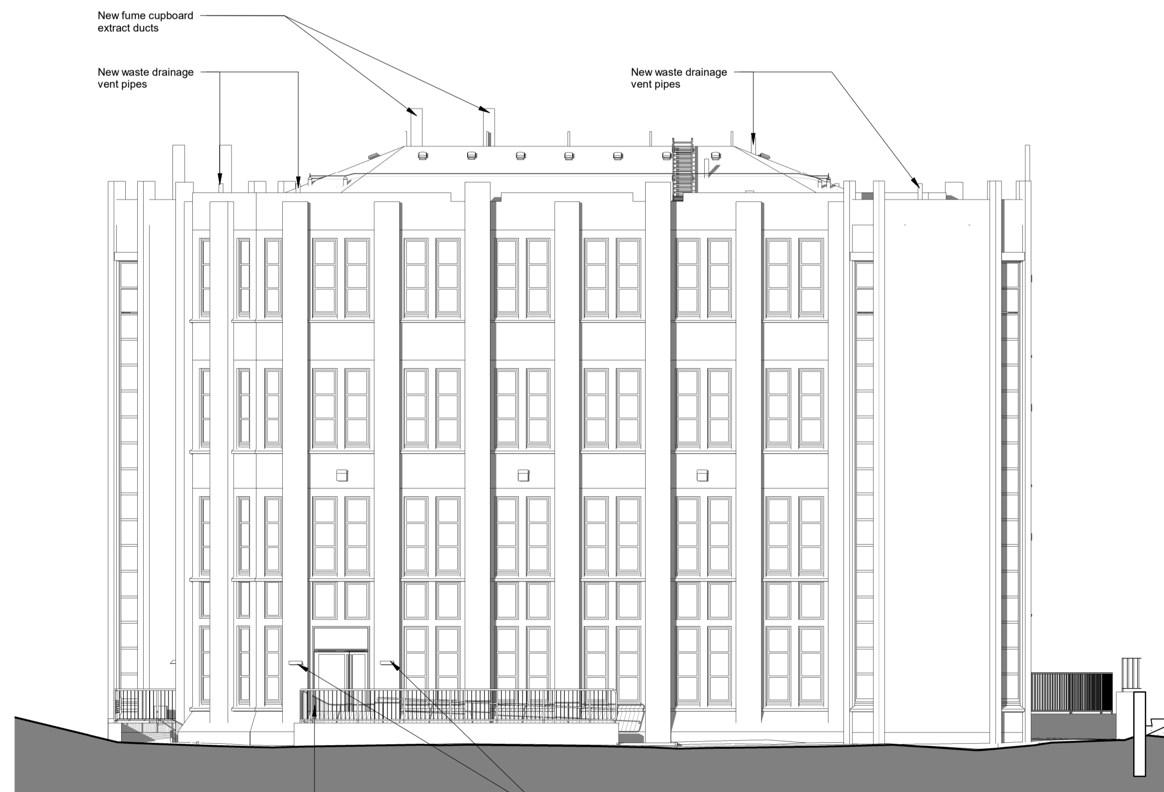
4 West Elevation - Proposed 1:100

New external doors and ramped access with retaining walls and balustrading New wall fixed luminaires