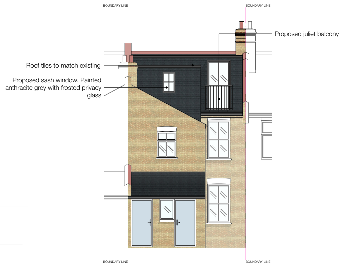
2 Proposed Rear Elevation 1:100 @ A3