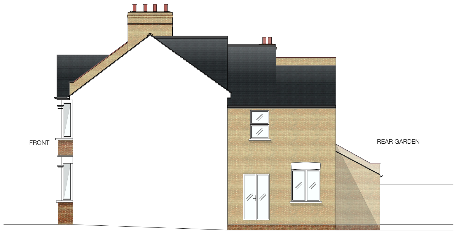
3 Proposed Side Elevation 1:100 @ A3