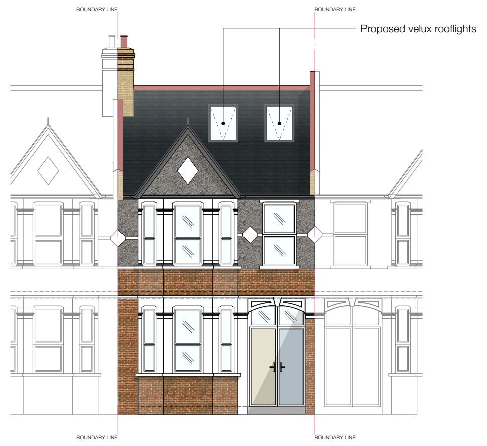
4 Proposed Front Elevation 1:100 @ A3