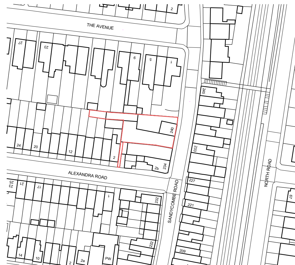
LOCATION PLAN Scale: 1:1250@A3