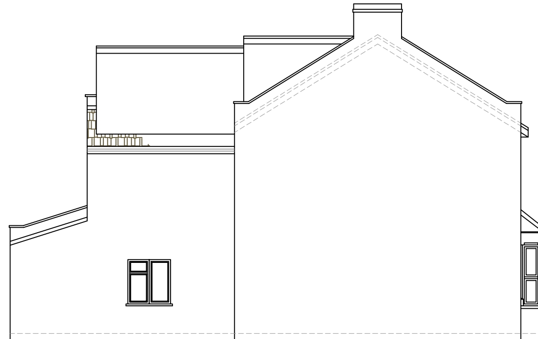
EXISTING ELEVATION SIDE B SCALE 1:100