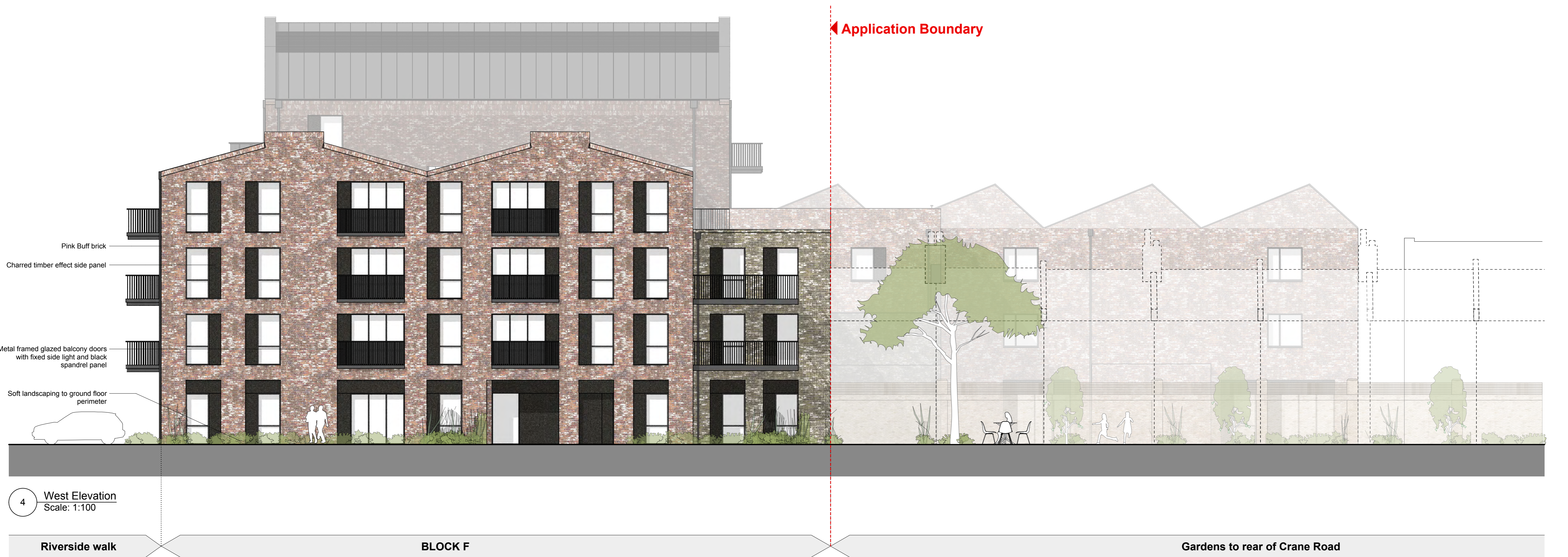
4 West Elevation Scale: 1:100

+44 (0)20 7736 7744 info@assael.co.uk www.assael.co.uk