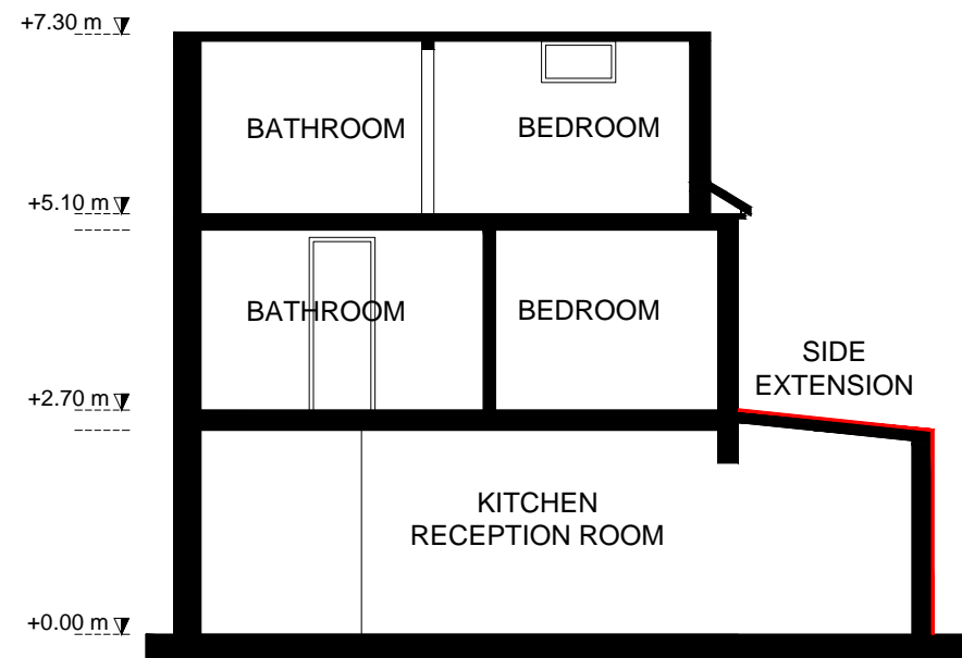
Proposed B-B Section