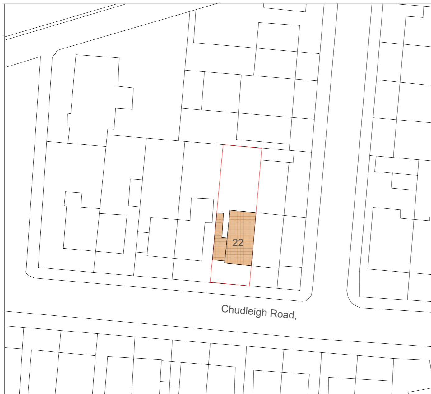
EXISTING BLOCK PLAN PLAN 1:500