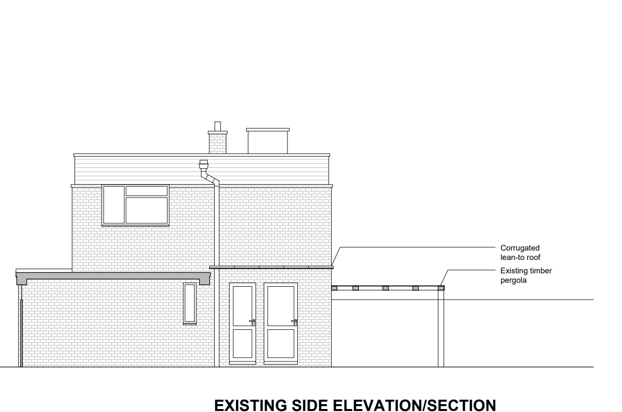
EXISTING SIDE ELEVATION/SECTION