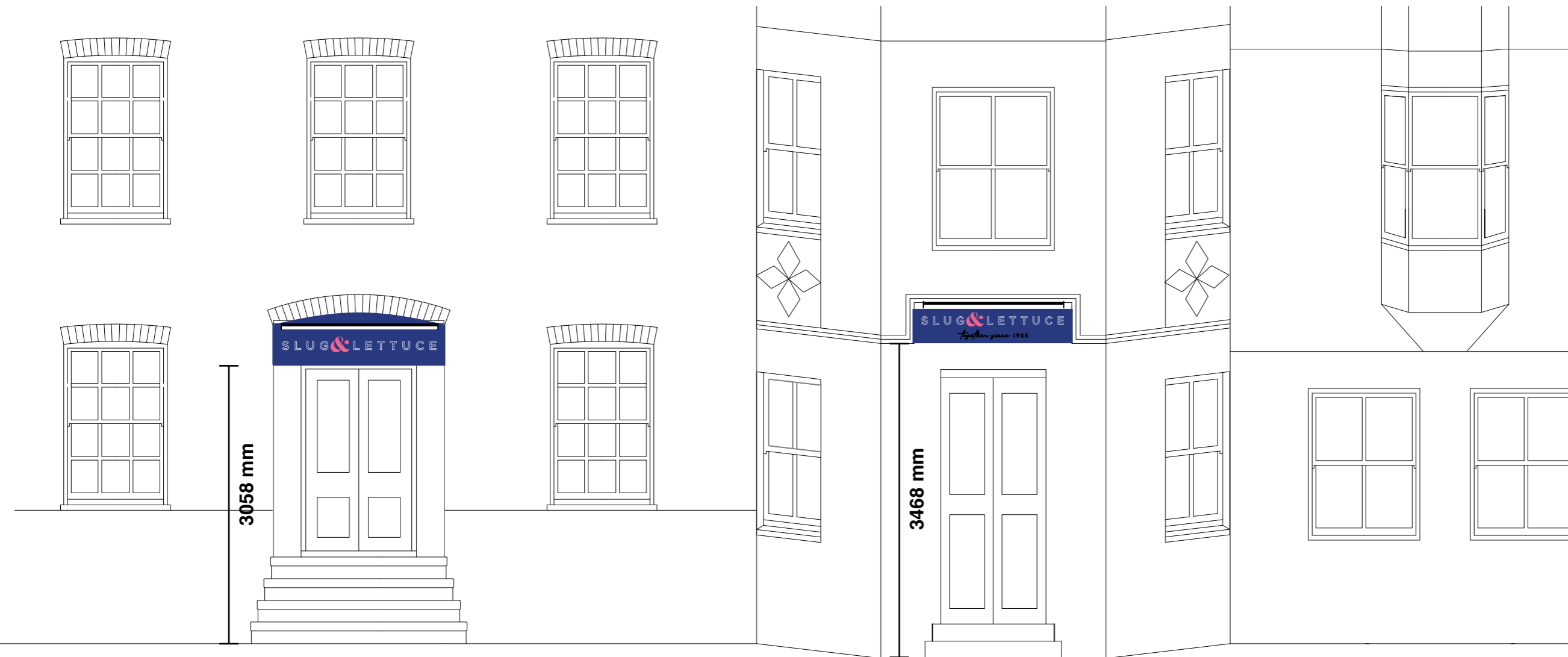
Front Elevation Scale 1:50