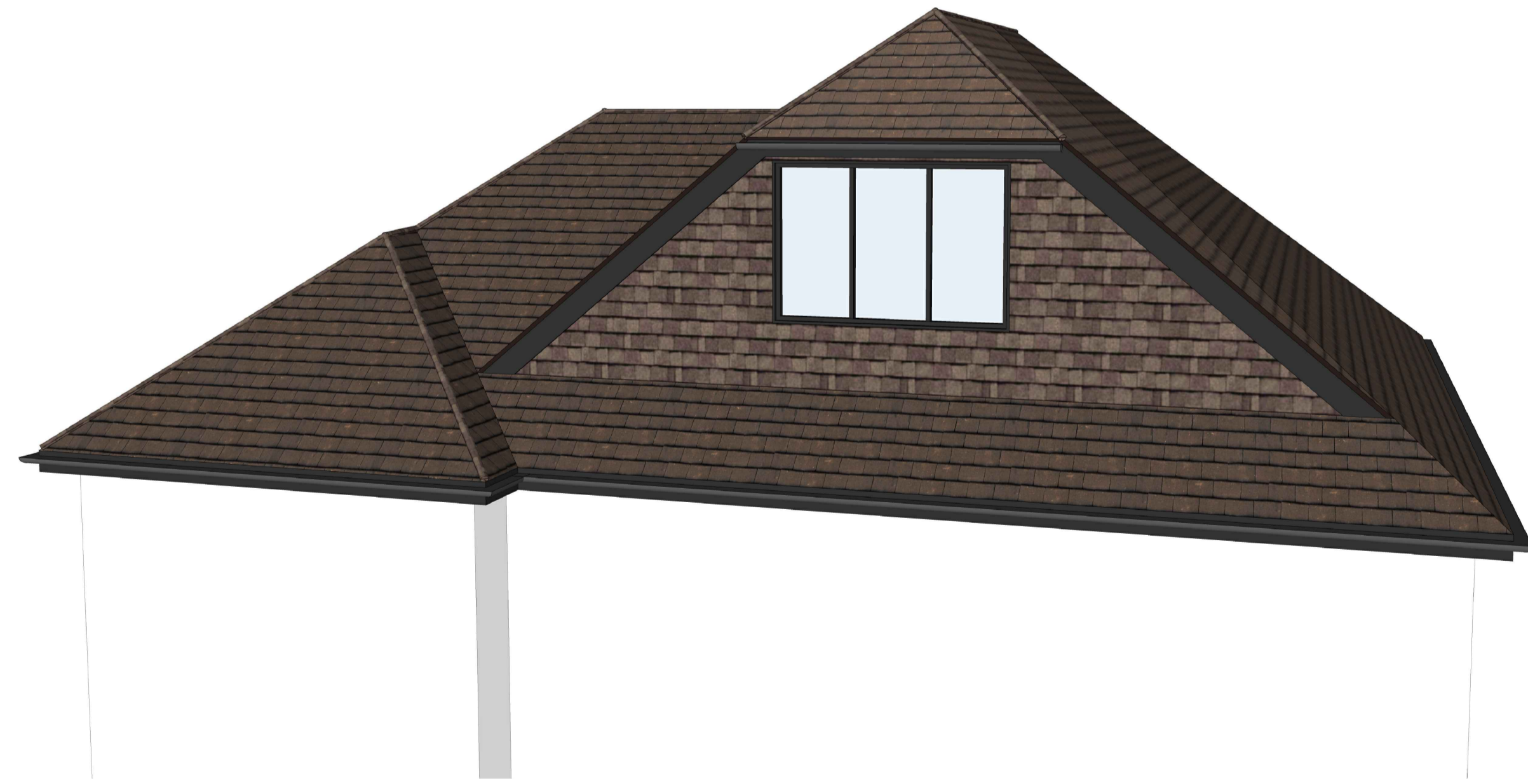
PROPOSED DORMER VISUAL