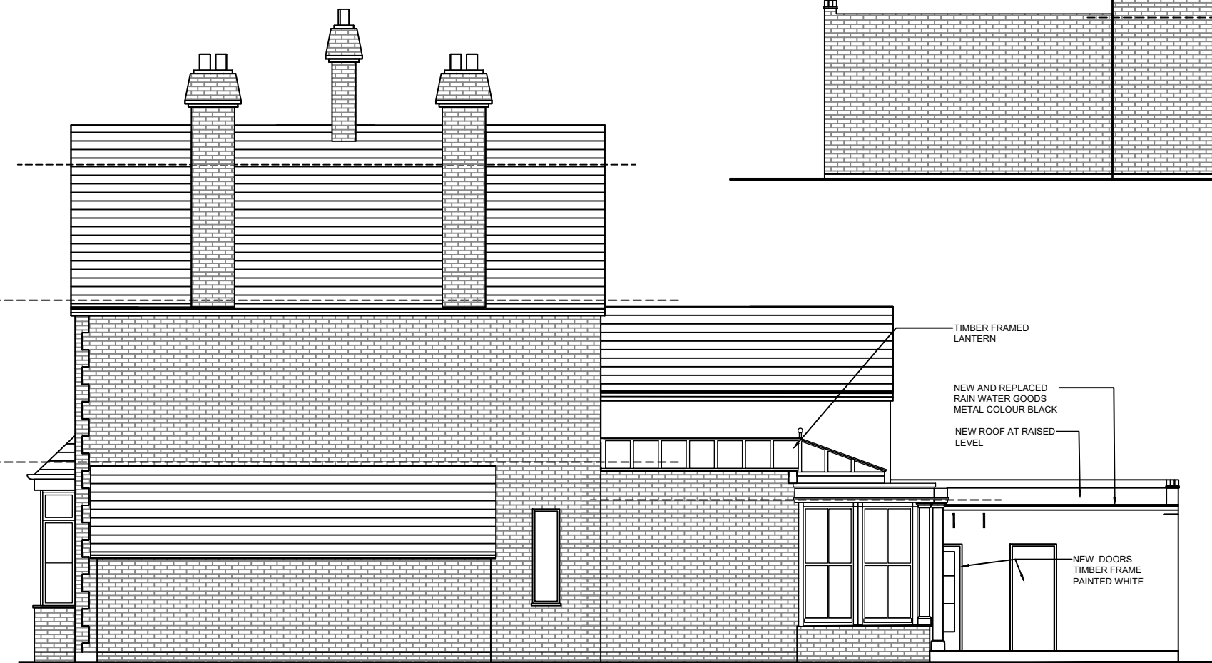
PLA PROPOSED NORTH WEST ELEVATION Scale 1:100