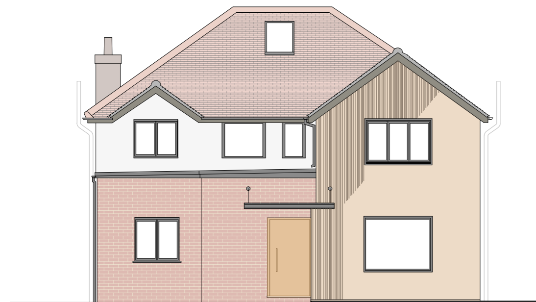
FRONT ELEVATION EXISTING