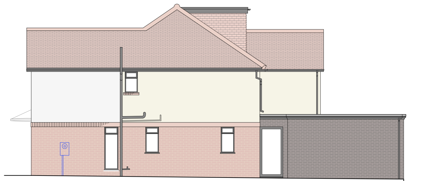
SOUTH SIDE ELEVATION EXISTING