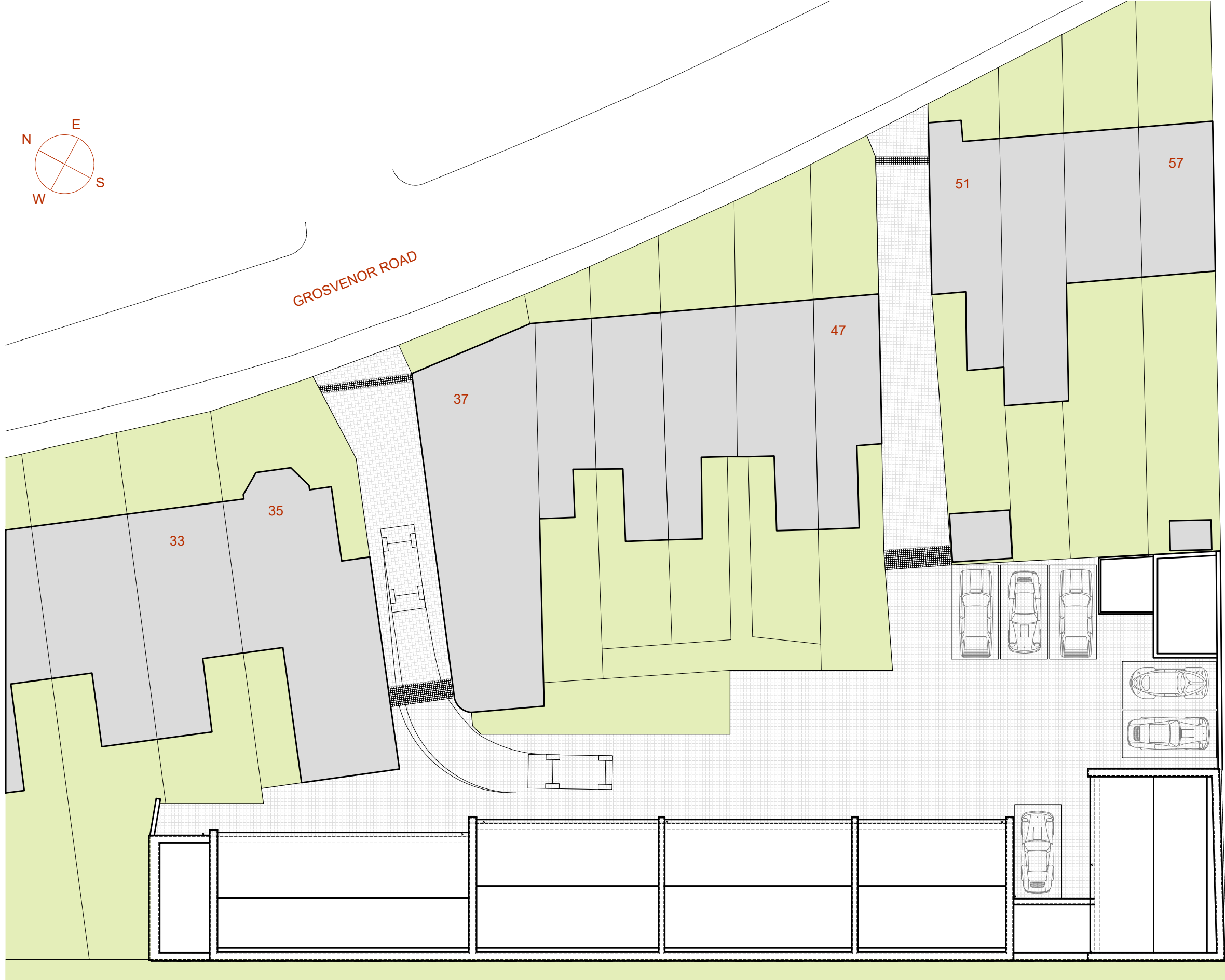
EXISTING & PROPOSED

do not scale from this drawing verify all dimensions by site measurement errors and omissions to be reported to the architect copyright drawing status issued for planning