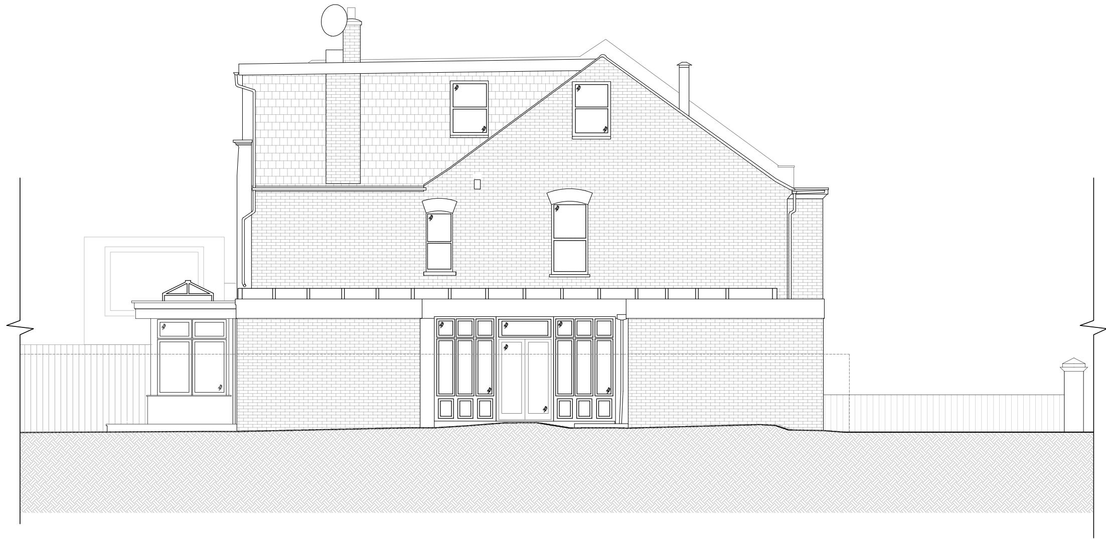
1 | SIDE ELEVATION AS EXISTING 00-22 | SCALE: 1:100 @ A3 // 1:50 @ A1

DISCLAIMER: Dimensions to be verified on site. Only figured dimensions to be used and any discrepancies in dimensions are to be reported to RJHA. No dimensions are to be scaled from printed drawings. Any areas indicated on this drawing are for guidance only. No responsibility is taken for their accuracy. There is a risk of injury or death in construction if works are not properly planned and supervised. The contractor must not undertake any elements of the work without first having carried out the necessary risk assessments and prepare detailed method statements.