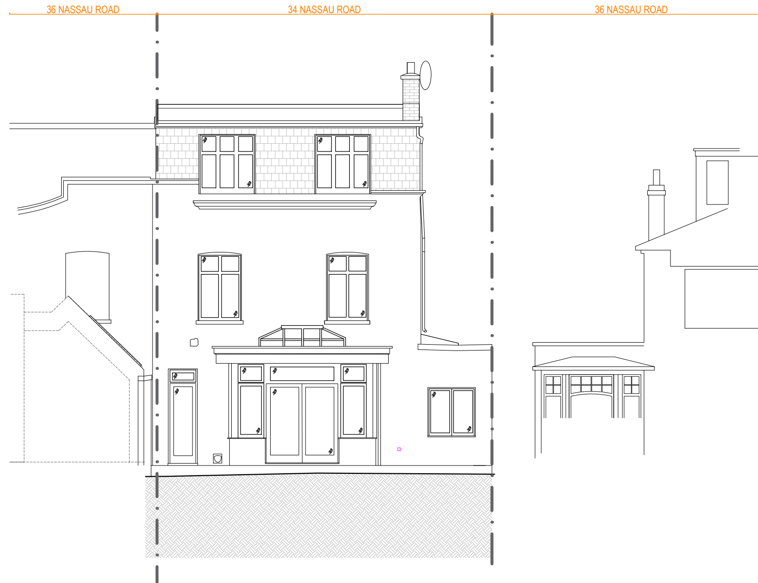
1 REAR ELEVATION AS EXISTING 00-23 SCALE: 1:100 @ A3 // 1:50 @ A1

DISCLAIMER: Dimensions to be verified on site. Only figured dimensions to be used and any discrepancies in dimensions are to be reported to RJHA. No dimensions are to be scaled from printed drawings. Any areas indicated on this drawing are for guidance only. No responsibility is taken for their accuracy. There is a risk of injury or death in construction if works are not properly planned and supervised. The contractor must not undertake any elements of the work without first having carried out the necessary risk assessments and prepare detailed method statements.