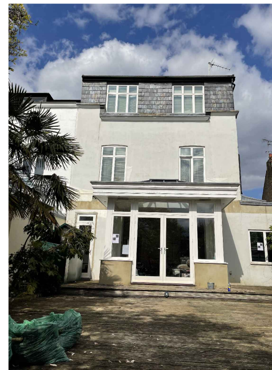
4 | EXISTING REAR PHOTOGRAPH

DISCLAIMER: Dimensions to be verified on site. Only figured dimensions to be used and any discrepancies in dimensions are to be reported to RJHA. No dimensions are to be scaled from printed drawings. Any areas indicated on this drawing are for guidance only. No responsibility is taken for their accuracy. There is a risk of injury or death in construction if works are not properly planned and supervised. The contractor must not undertake any elements of the work without first having carried out the necessary risk assessments and prepare detailed method statements.