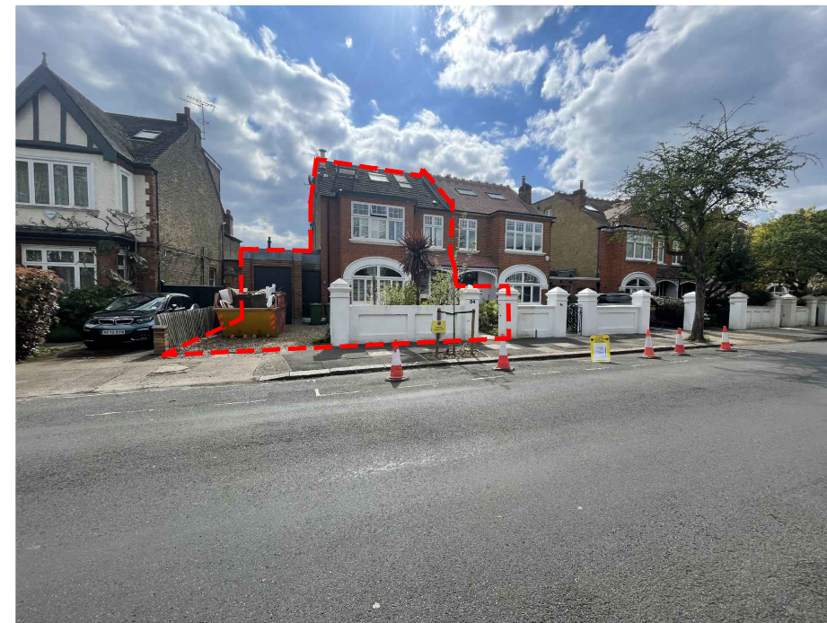
3 | EXISTING FRONT PHOTOGRAPH