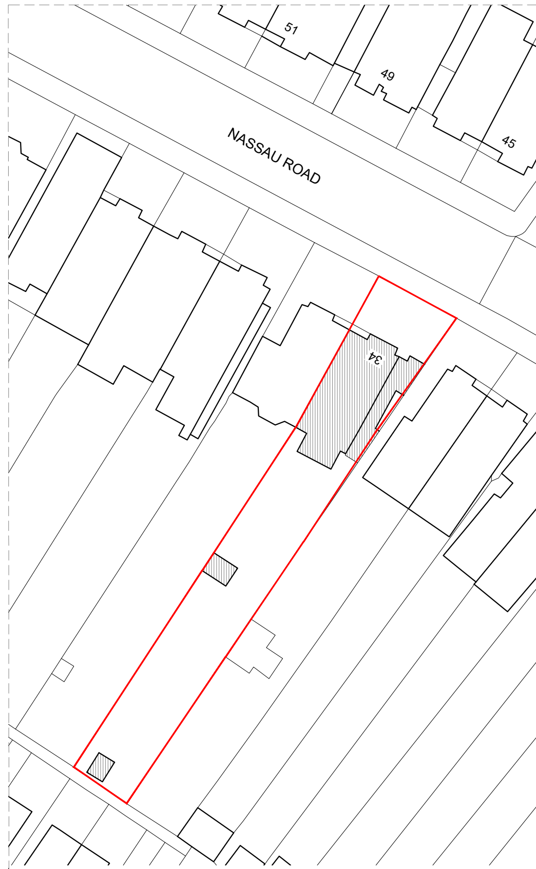
2 | SITE PLAN SCALE: 1:500 @ A3 // 1:1250 @ A1