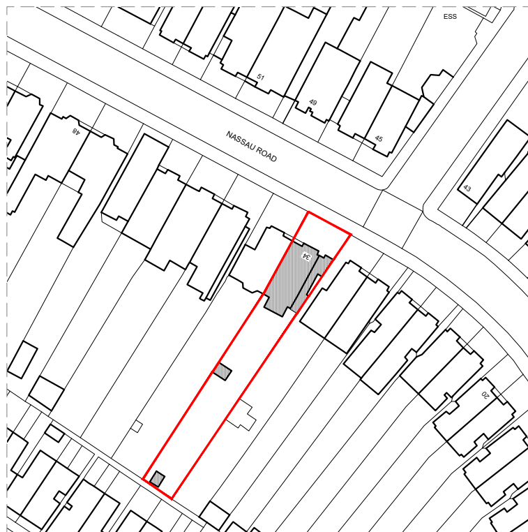
1 | LOCATION PLAN SCALE: 1:1250 @ A3