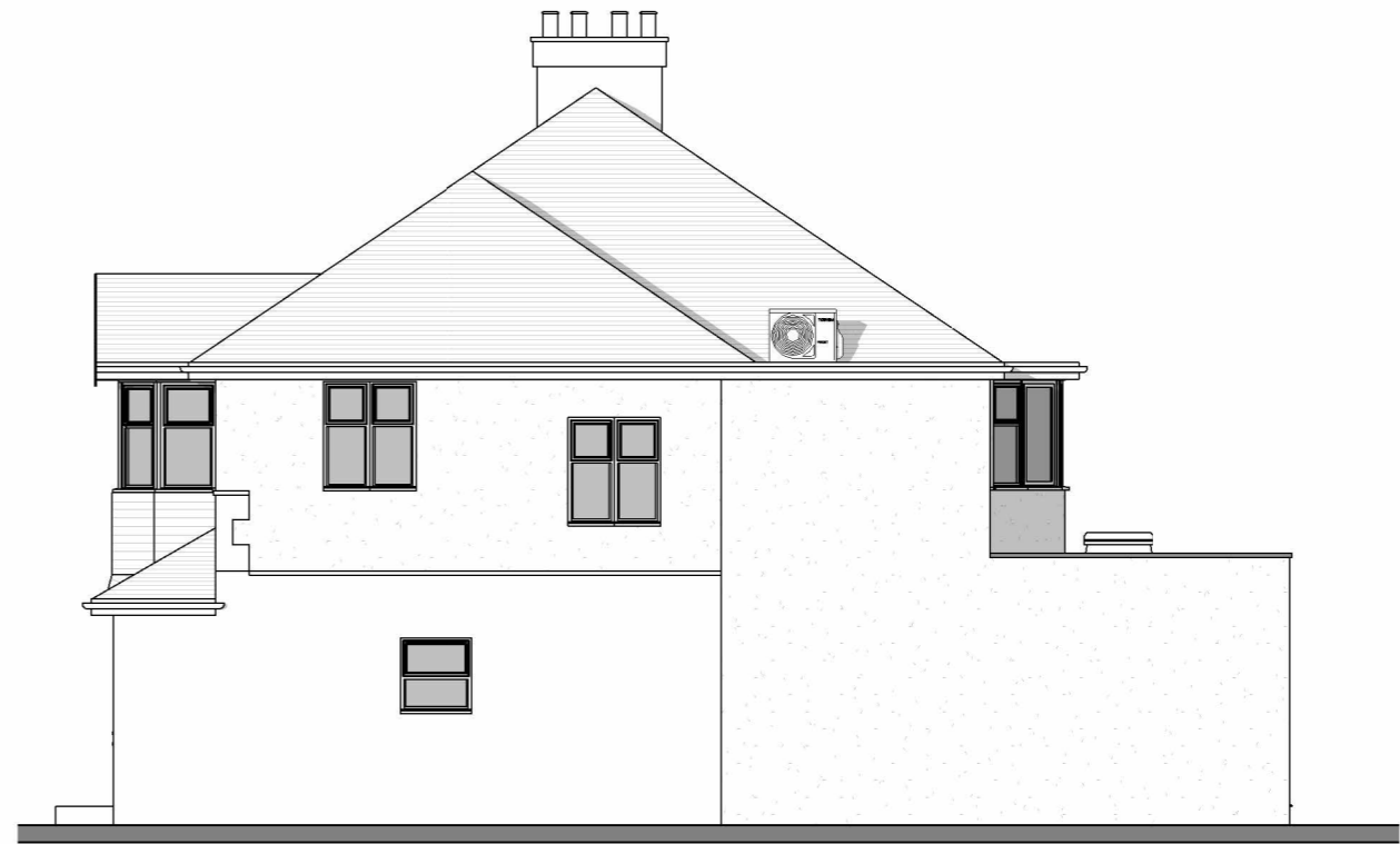
Side 1 Elevation