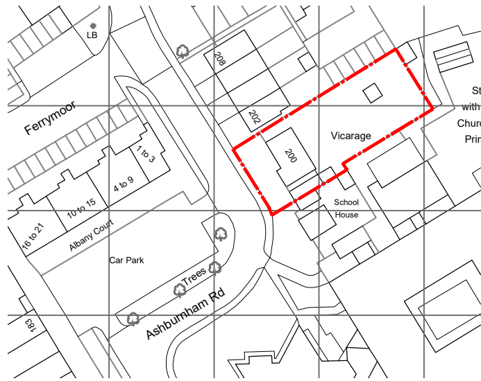
SITE LOCATION PLAN SC 1:1250