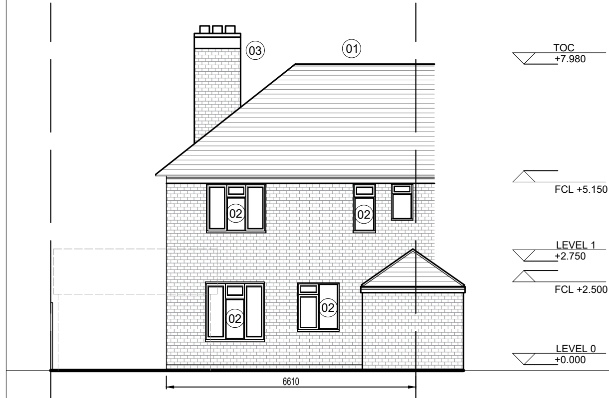
02 02_003 EXISTING REAR ELEVATION Scale 1:100