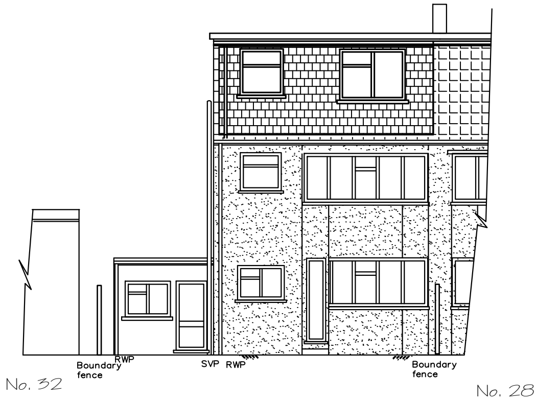
Rear elevation existing 1:100