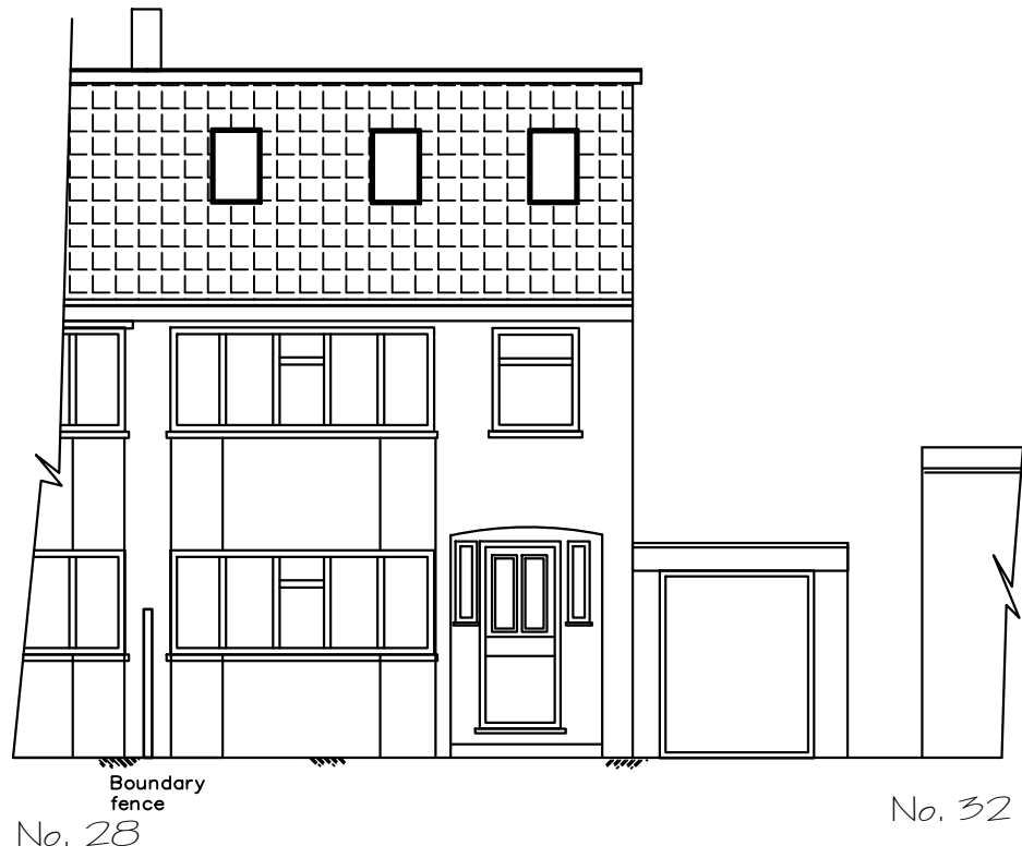
Front elevation existing 1:100

Note: Loft granted permission under application number: 24/0075/PS192 but not yet constructed.