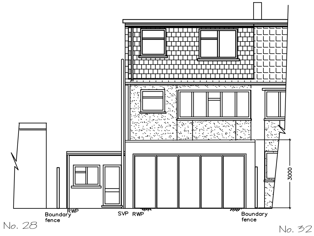
Rear elevation existing 1:100