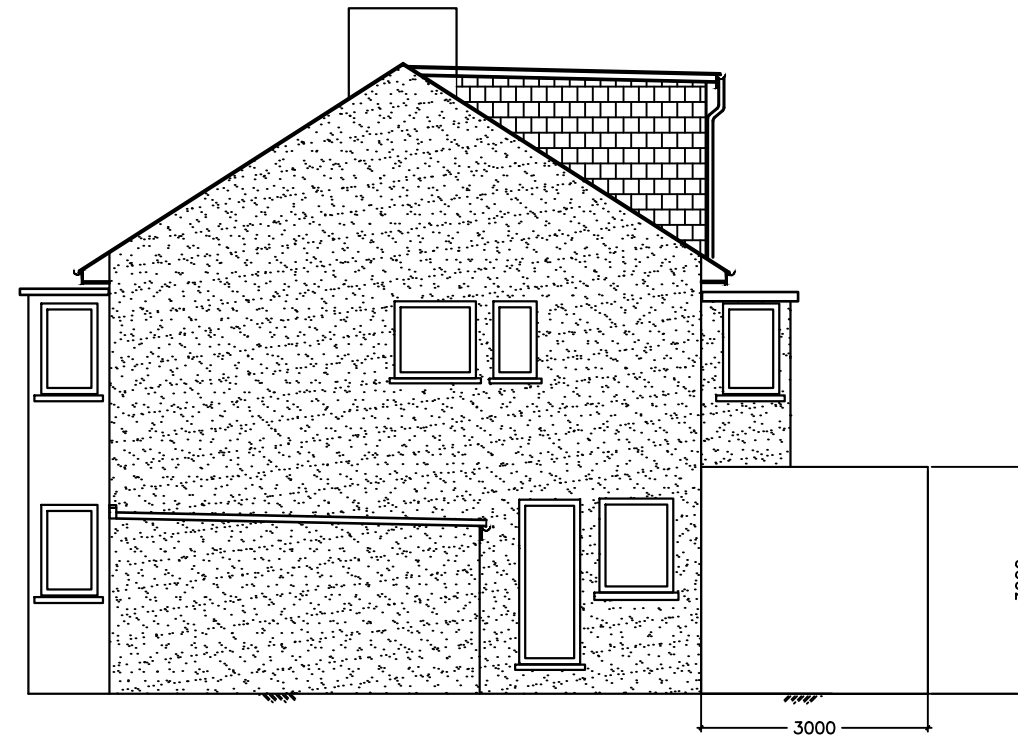
Side elevation existing 1:100