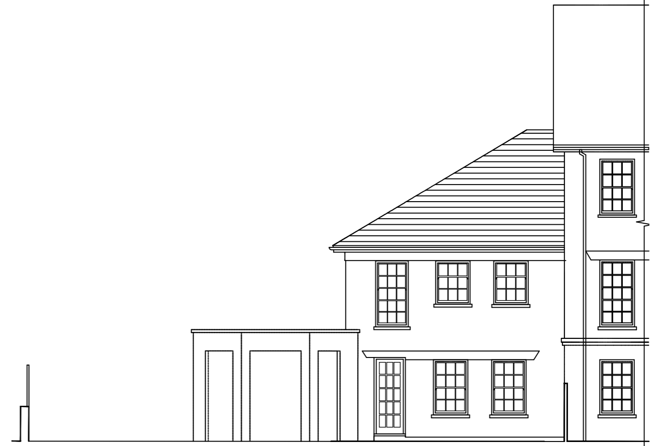
4 EXISTING - REAR ELEVATION 1:100