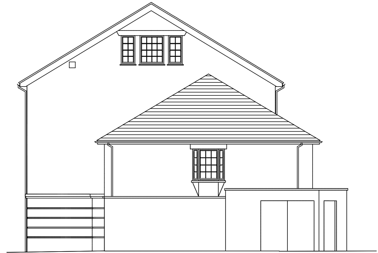
2 EXISTING - SIDE ELEVATION 1:100

This drawing is not to be scaled. All dimensions to be checked on site before production or work begins on site.