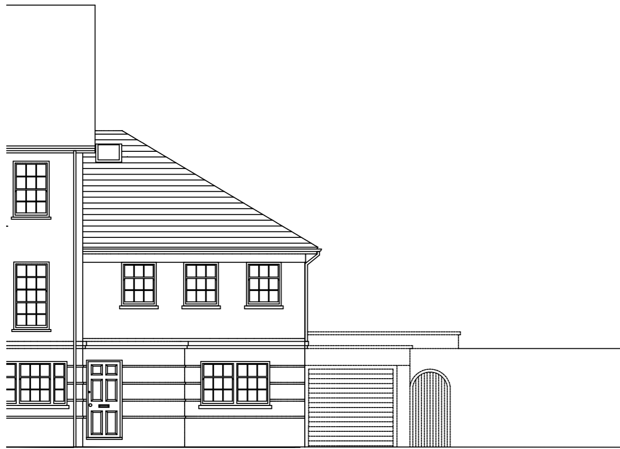
1 EXISTING - FRONT ELEVATION 1:100