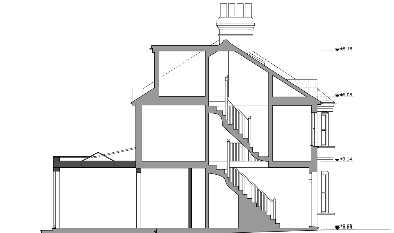
PROPOSED SECTION AA