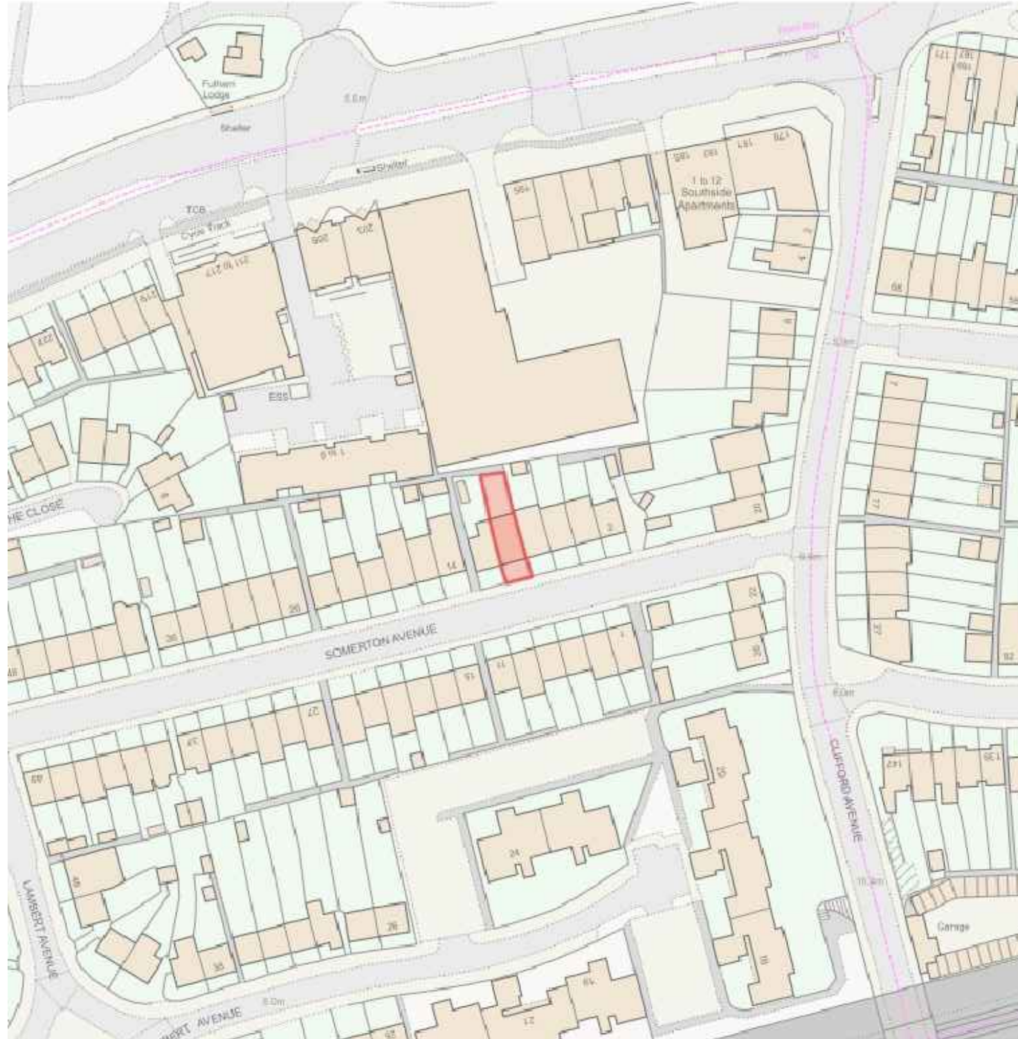
Location plan 1:1250 0 12.5 25 37.5m North