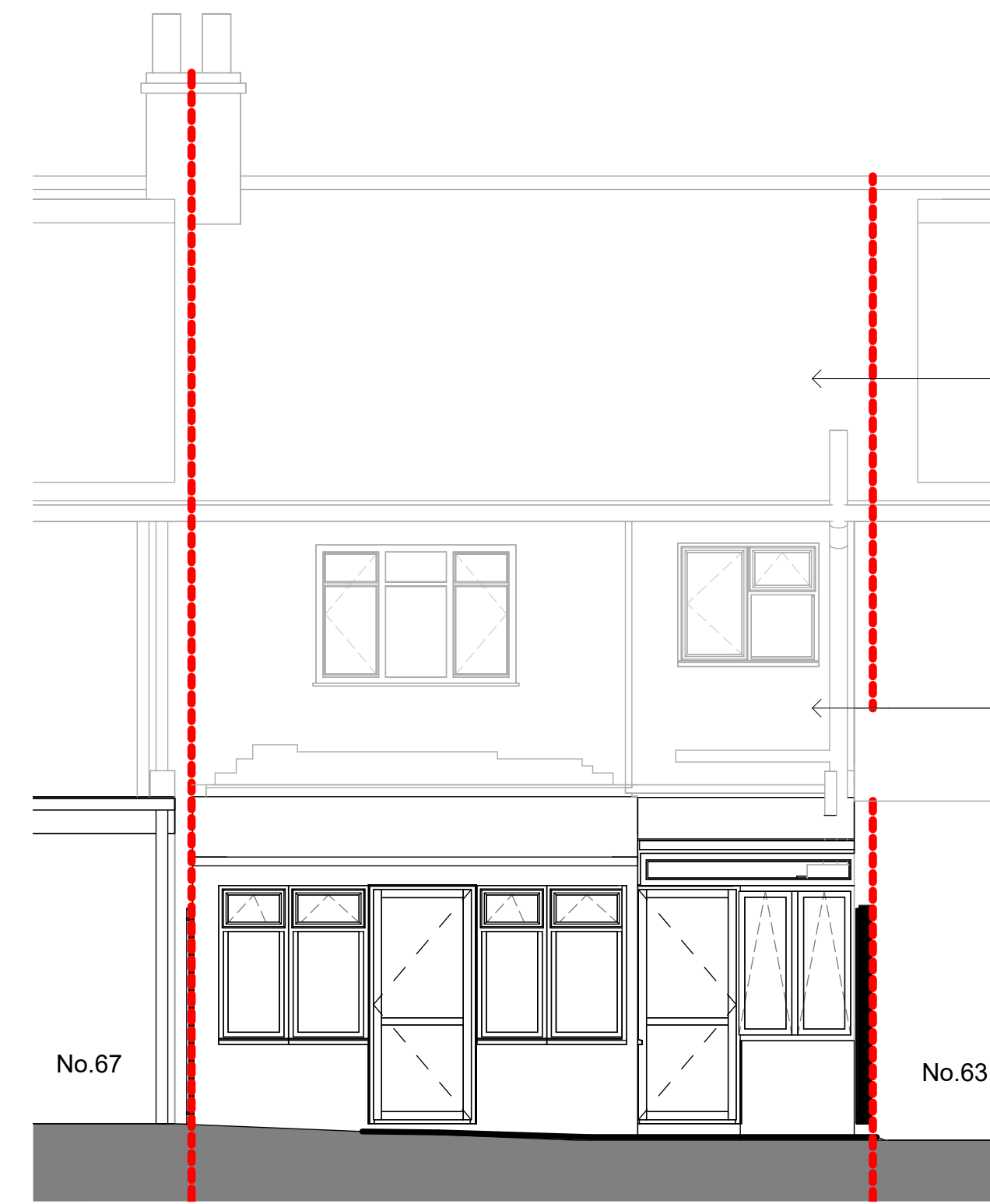
2 Existing - Rear Elevation 1:50