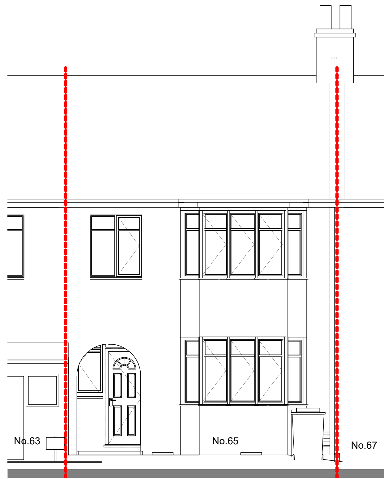
1 Existing - Front Elevation 1:50