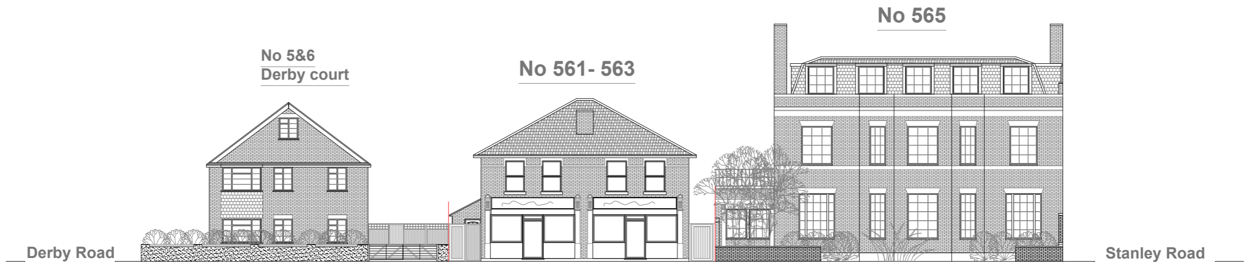
Existing Street Elevation Scale: 1:200