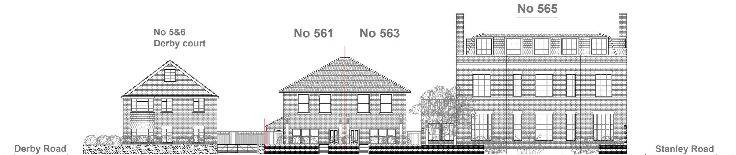
Proposed Street Elevation Scale: 1:200

Proposed Flank Wall Window to be Obscure Glazed and Non Opening below 1.7m from FFL