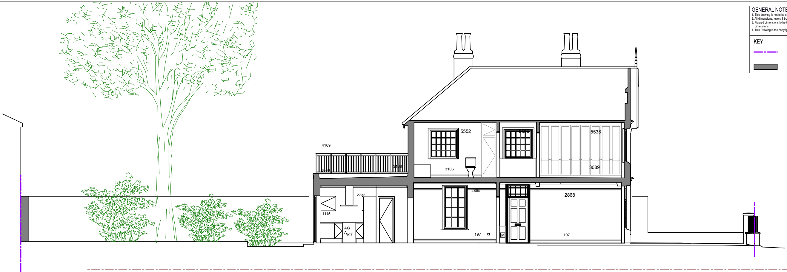
2 SECTION / ELEVATION B - B AS EXISTING 1:100