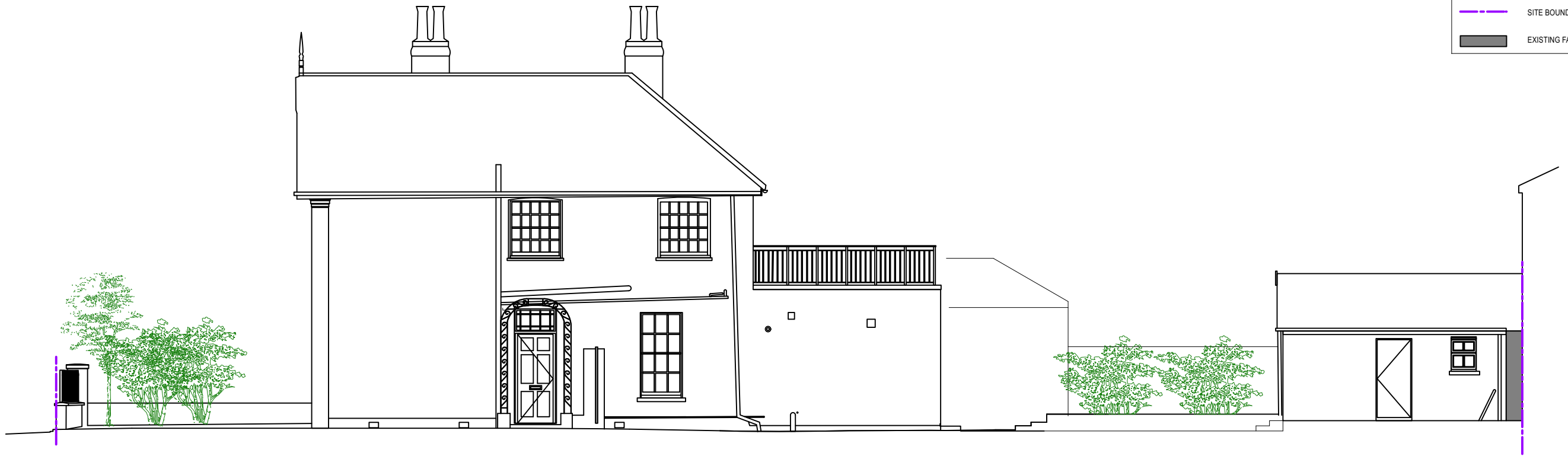
2 EAST ELEVATION AS EXISTING 1:100

KEY - - - - - SITE BOUNDARY ■ ■ ■ ■ ■ EXISTING FABRIC