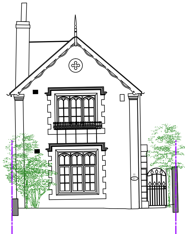
1 FRONT ELEVATION AS EXISTING 1:100