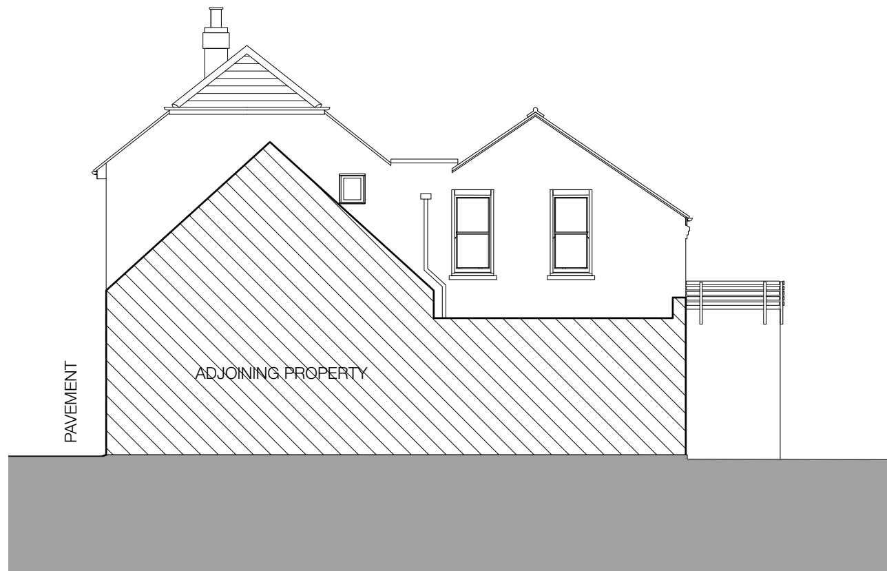
Existing south west elevation scale 1:100@A3