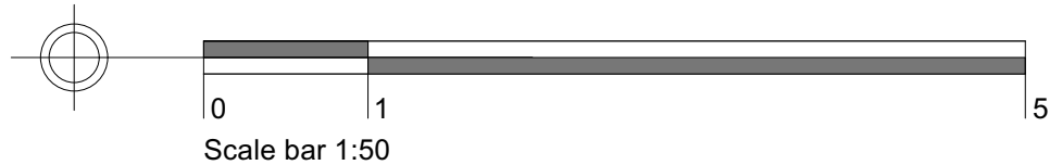
Scale bar 1:50