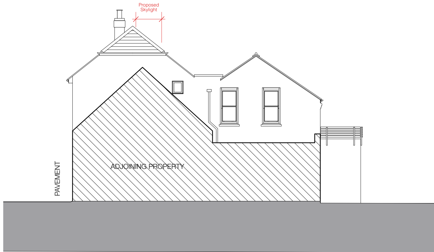
Proposed south west elevation scale 1:100@A3