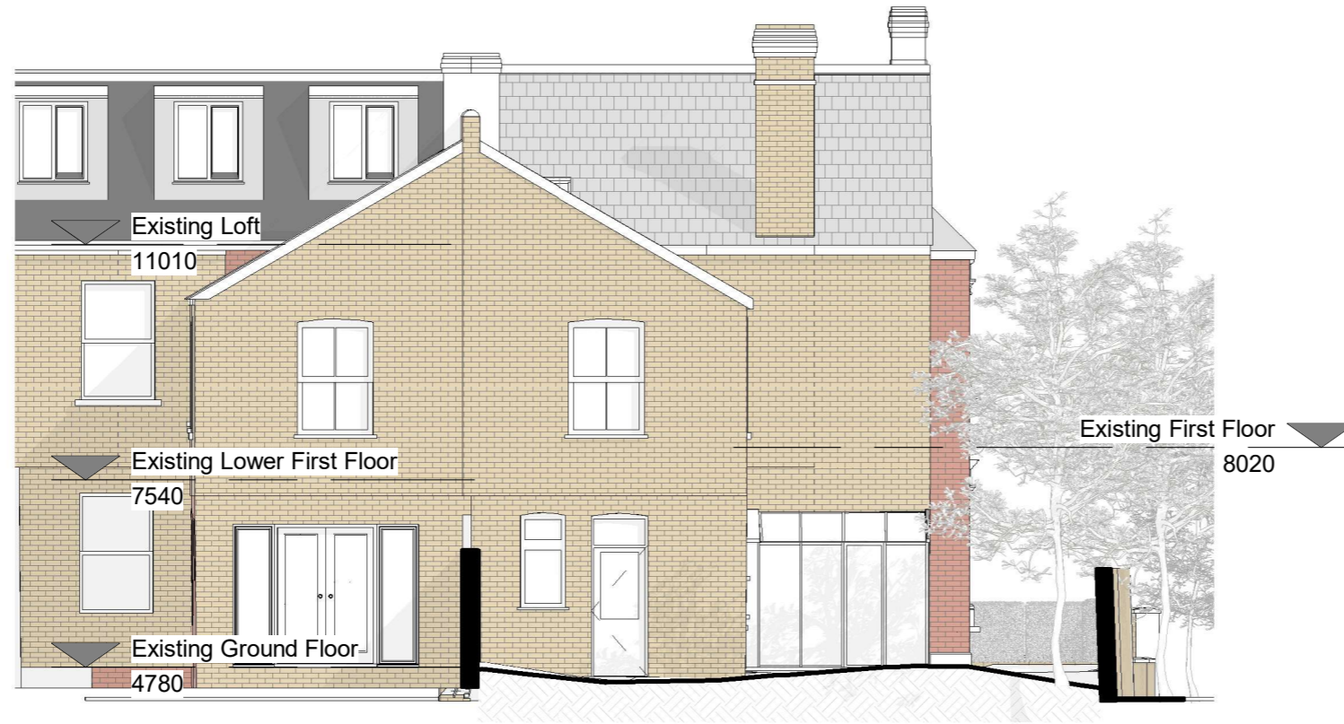
① Rear Elevation (NW)