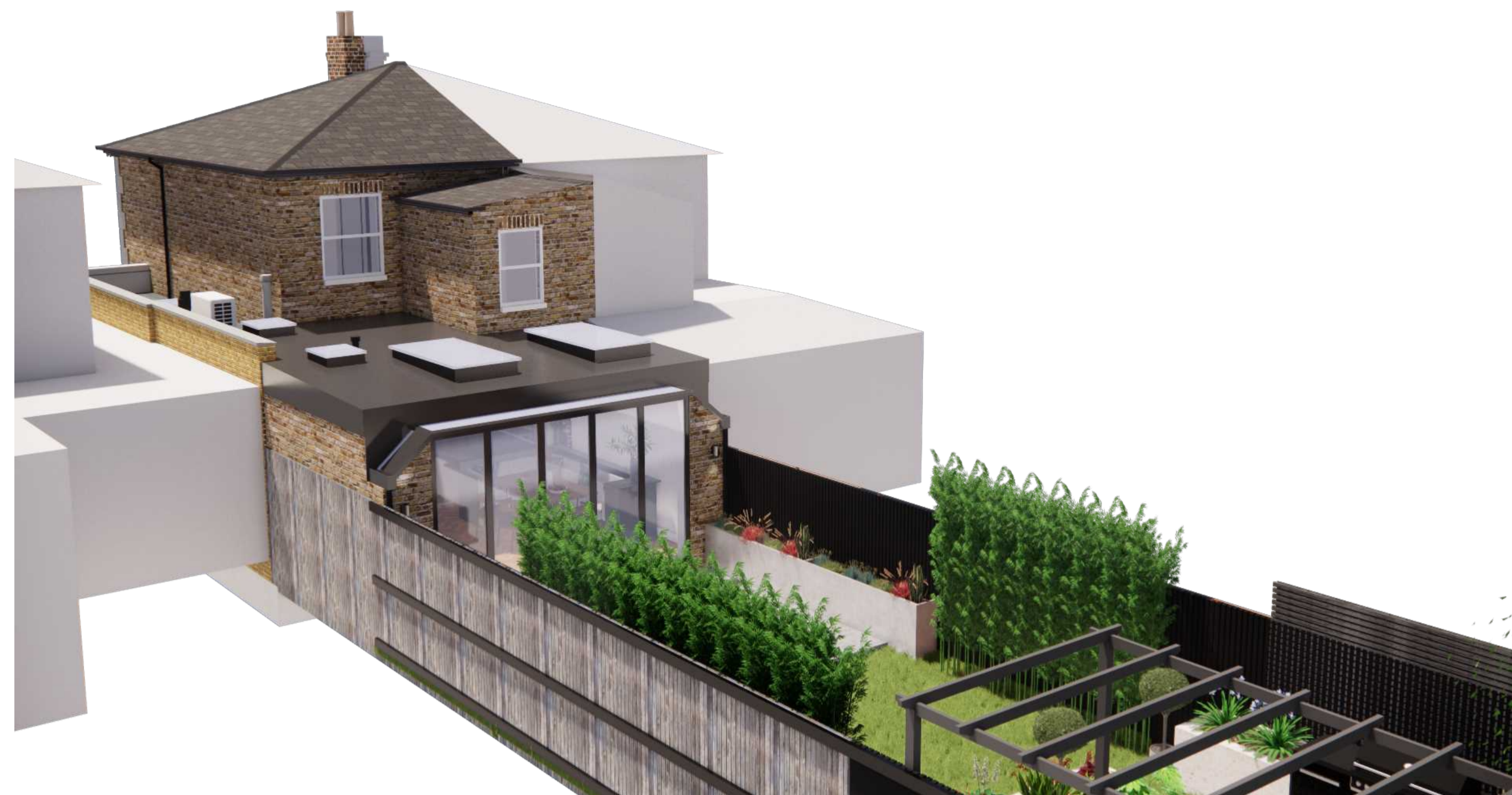
A 01 PROPOSED VIEW scale: