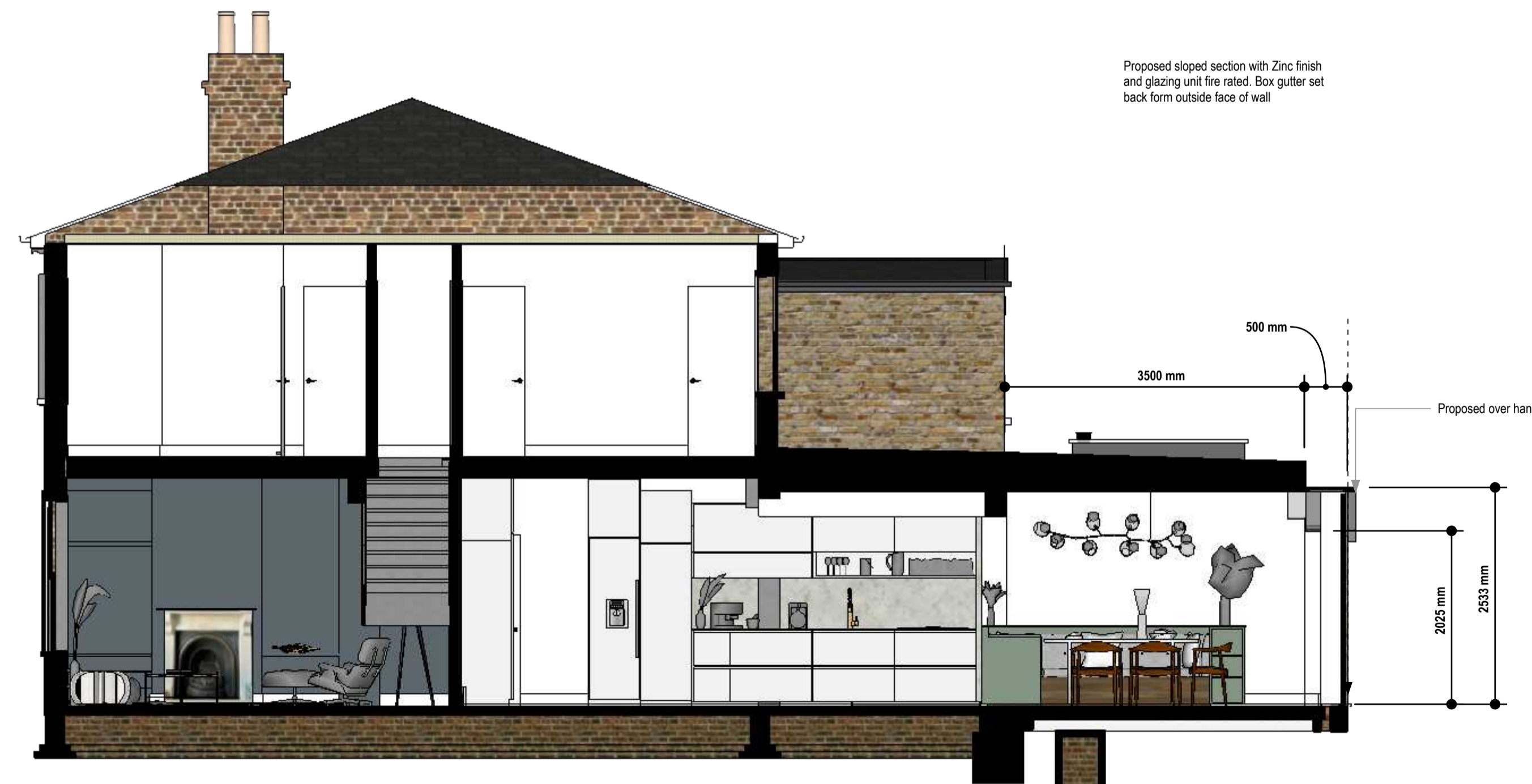
A 01 PROPOSED SECTION D-D scale: 1:50