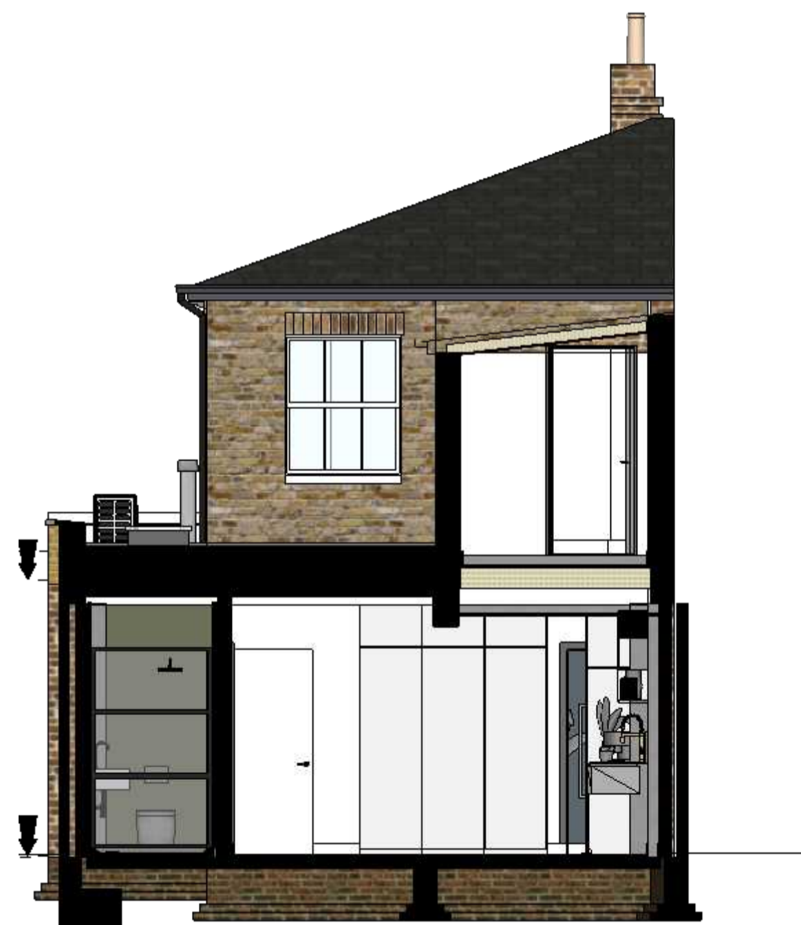
A 01 PROPOSED SECTION C-C scale: 1:50