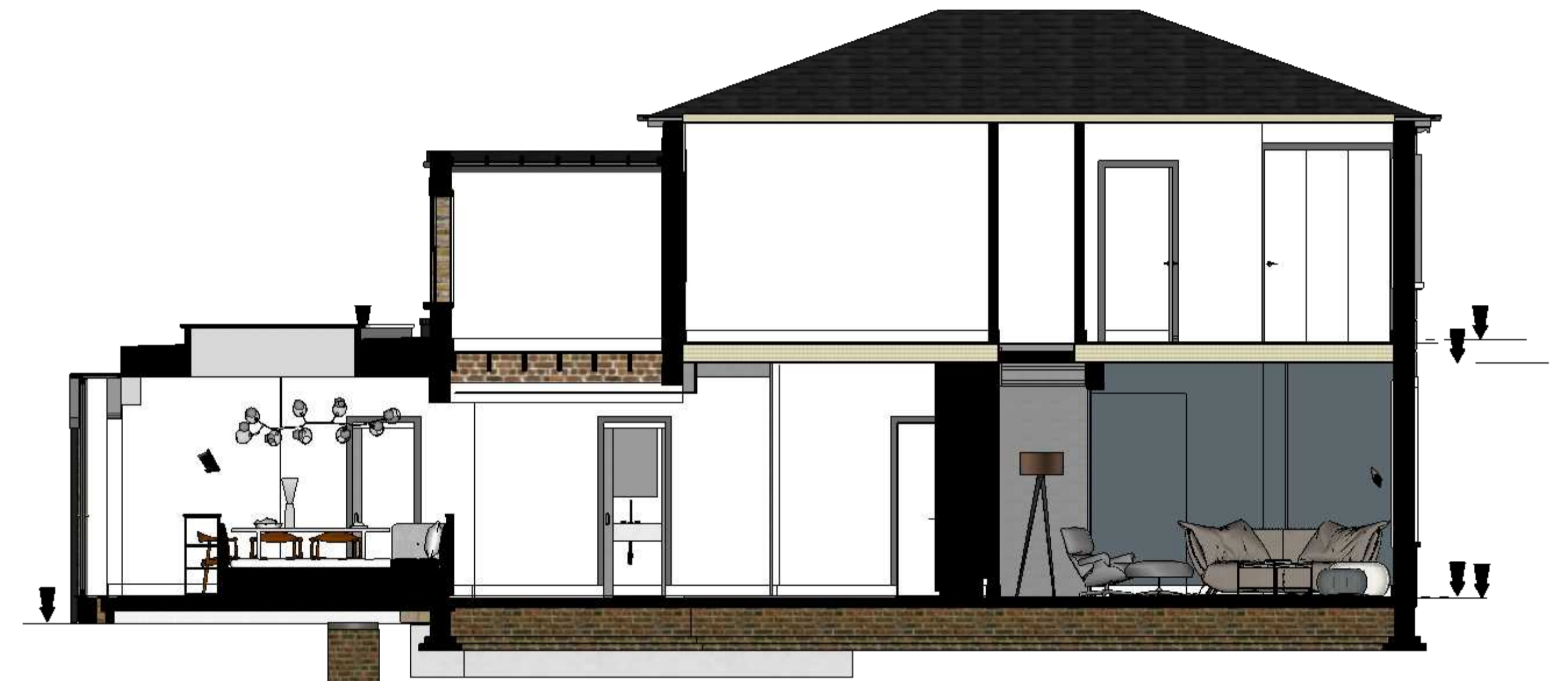
A 01 PROPOSED SECTION B-B scale: 1:50