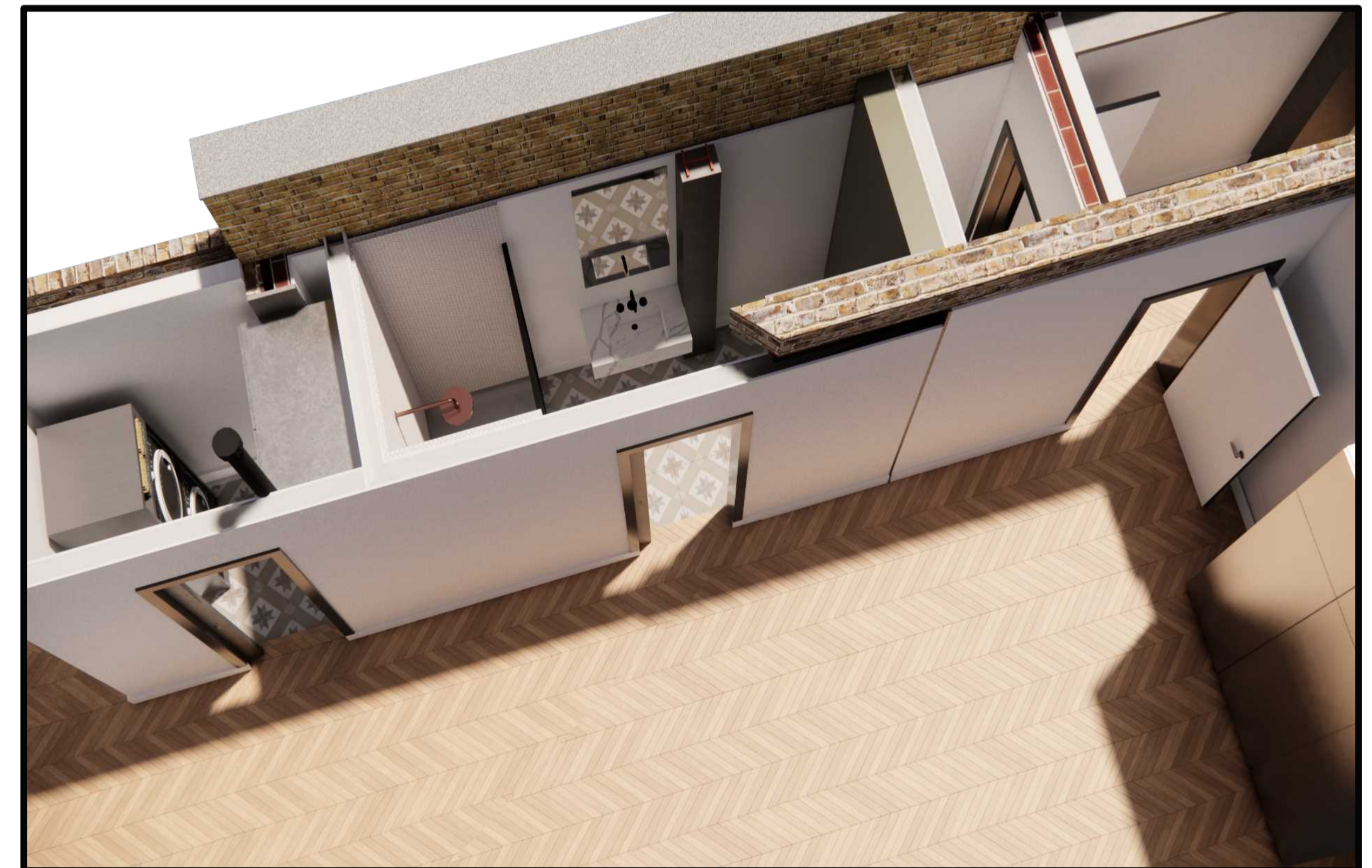
A 01 PROPOSED VIEW scale: