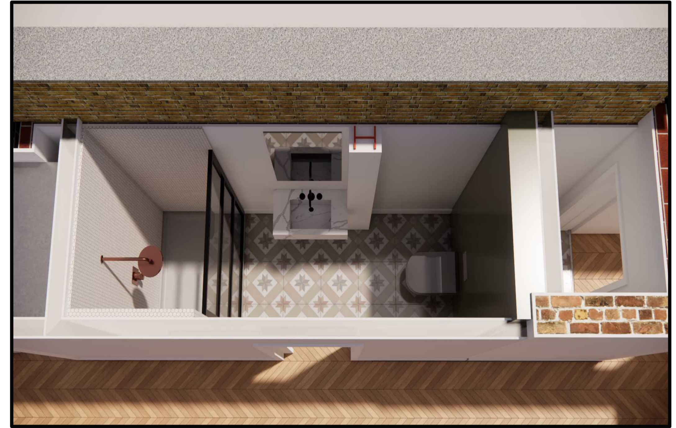
A 01 PROPOSED VIEW scale: