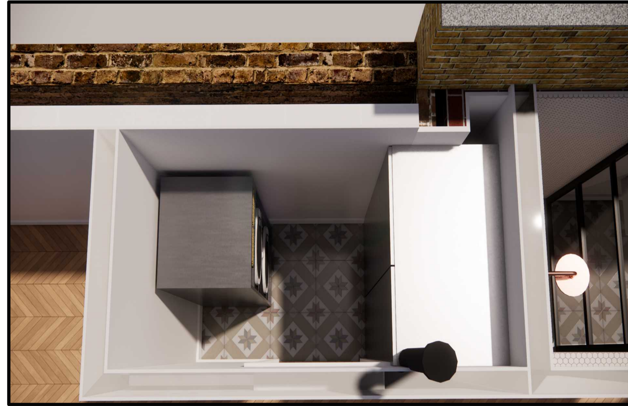
A 01 PROPOSED VIEW scale: