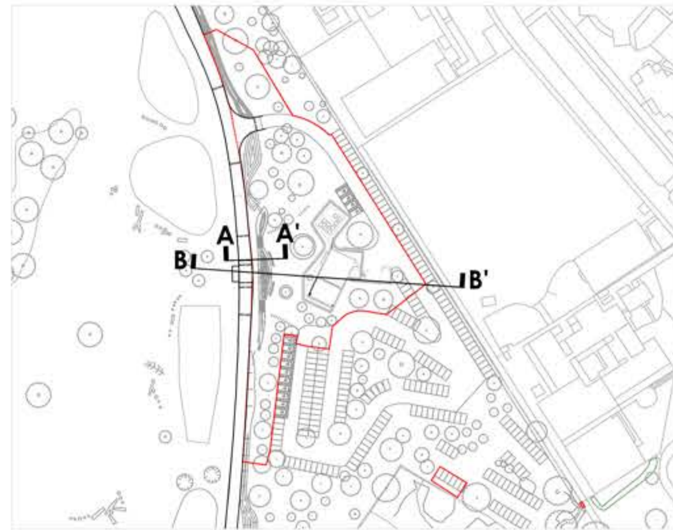
Location Plan (NTS)