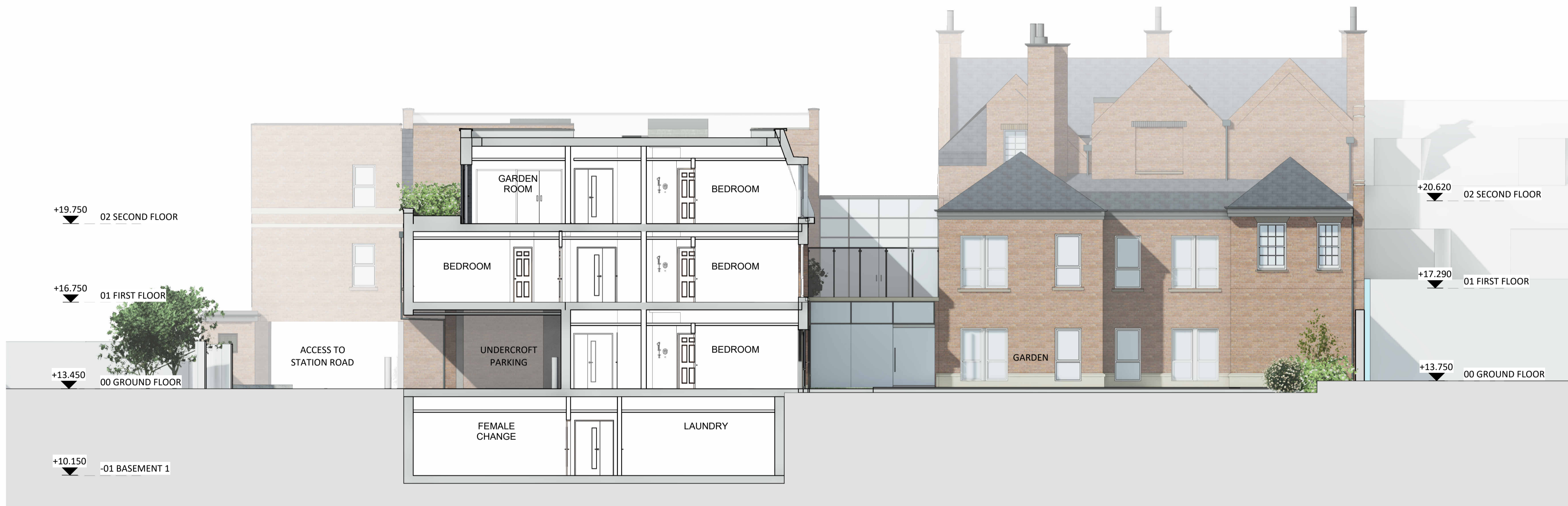
SECTION AA - NORTH ELEVATION THROUGH COURTYARD GARDEN 1 : 100