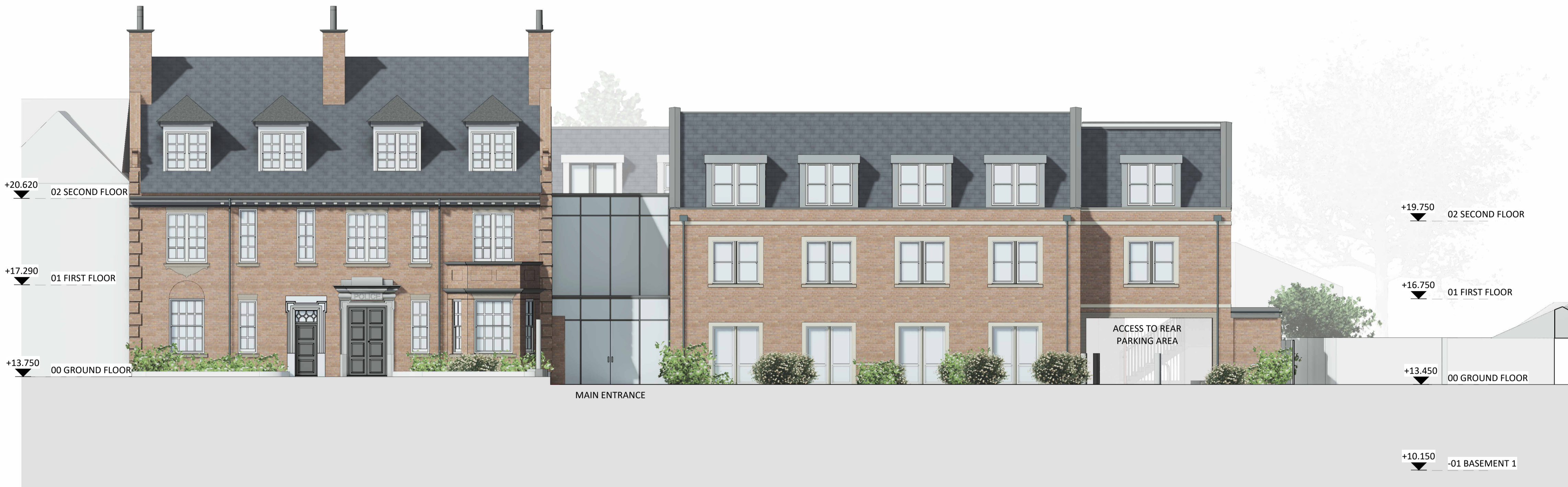
STATION ROAD ELEVATION - SOUTH ELEVATION 1 : 100