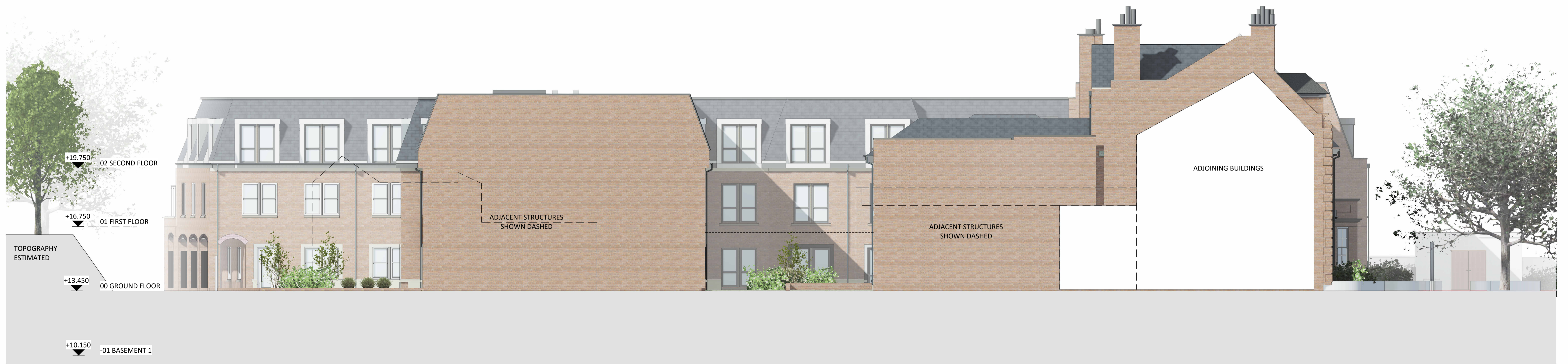
ELEVATION E - WEST ELEVATION 1 : 100